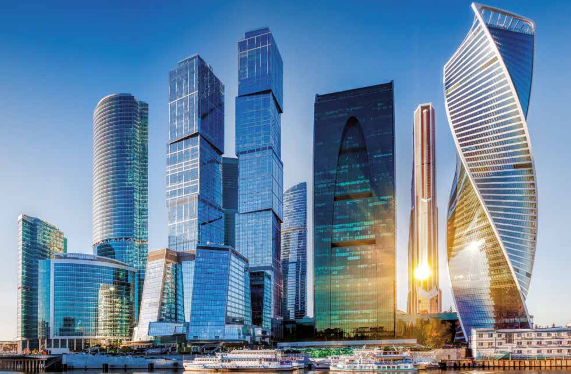
High buildings in Moscow.