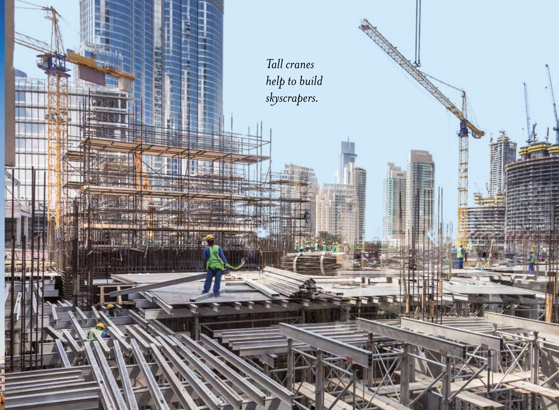
Tall cranes help to build skyscrapers.