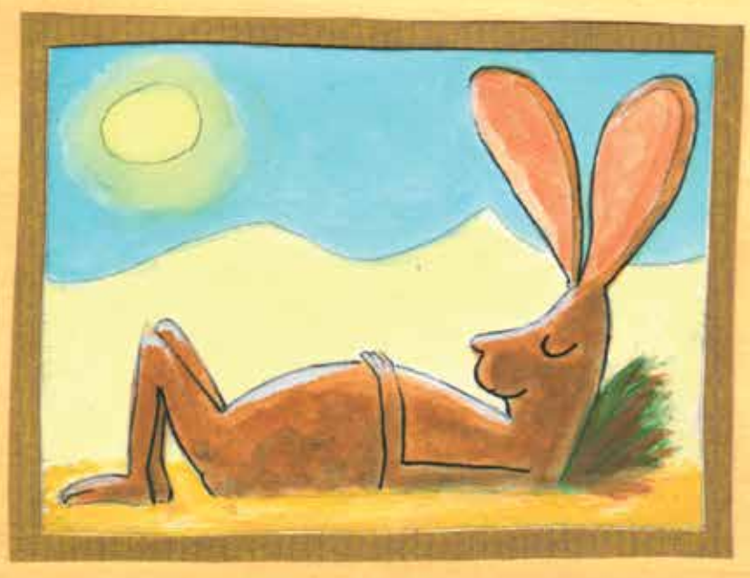
The brush rabbit enjoys high temperatures. It lives in dry and hot surroundings. It has big, long ears to cool down.