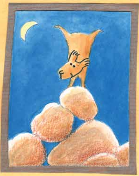
The pika, or whistling hare, looks like a small mouse. And yet, it's related to the rabbit! It has small. round ears and no tail.

The arctic hare is well equipped to withstand the cold. Since its fur is white, it can easily hide in the snow.