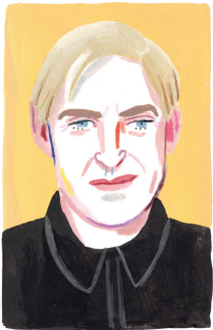
WILLEM DE KOONING