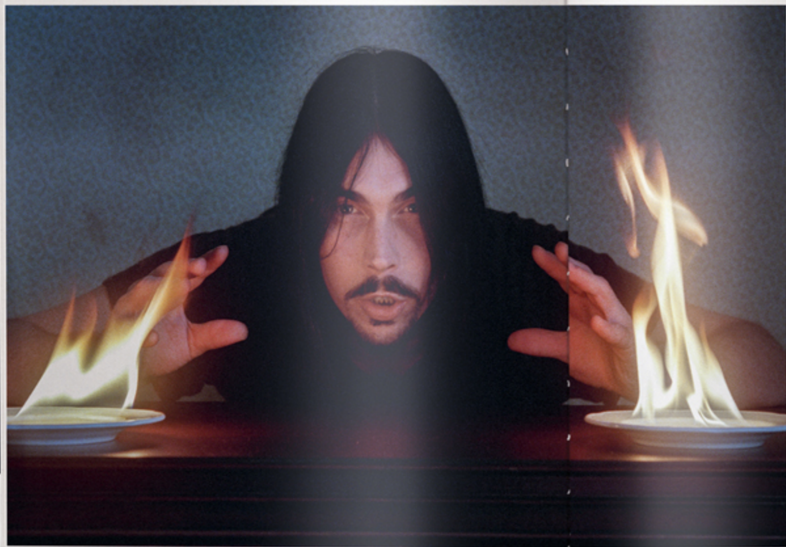
Dave Wyndorf, Monster Magnet Amsterdam 1995

As a rule, on press days a photographer is given 10 or 15 minutes with the artist in question. The door opens and you find yourself one-on-one with your subject (or perhaps with minders or assistants also present), at which point you issue requests and instructions that are – again as a rule! – politely acceded to. Very occasionally, however, an artist will have made plans of their own, and a memorable example was Dave Wyndorf, lead singer and guitarist with American rock band Monster Magnet , who had prepared two saucers with sulfur on top to set on fire.