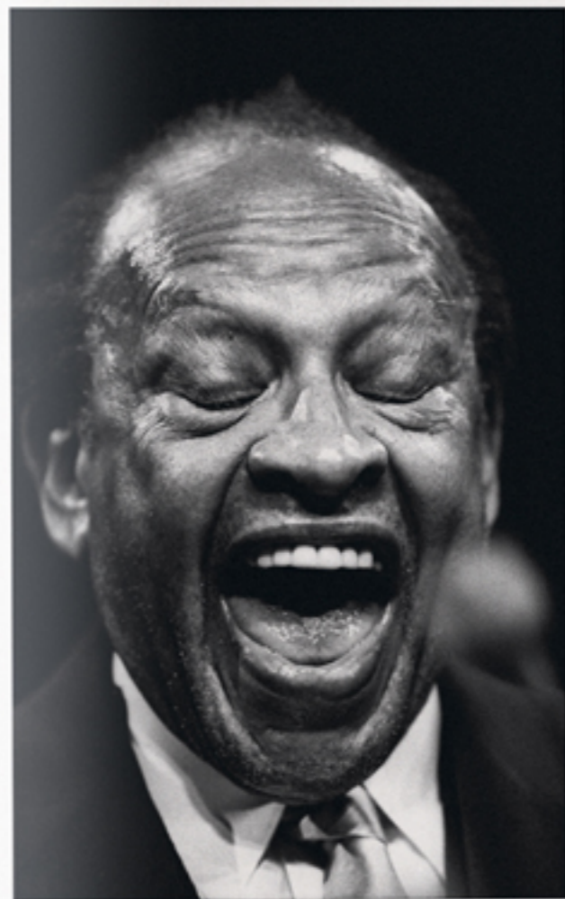
Lionel Hampton North Sea Jazz Festival, The Hague 1994