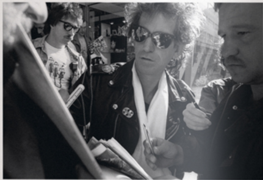
Keith Richards, The Rolling Stones Rotterdam 1990