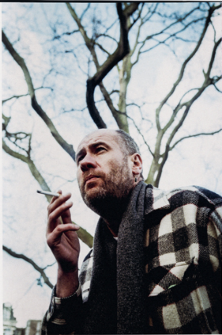
Fish Amsterdam 1999