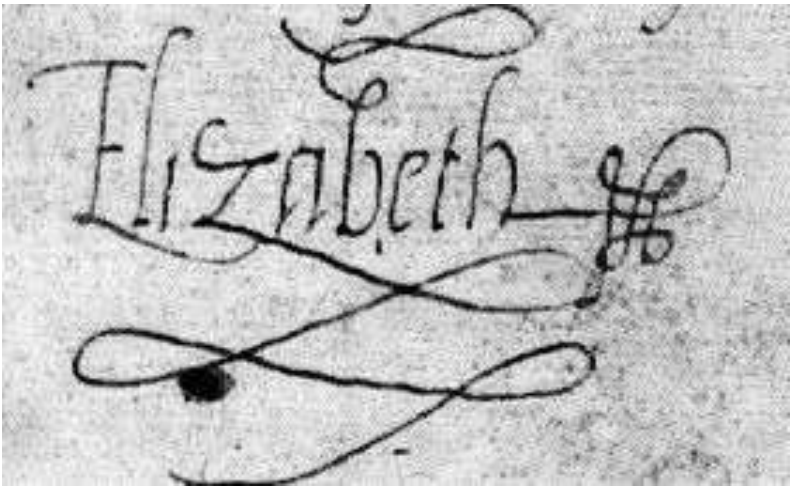
Elizabeth's signature as Princess of England, 1549.

or mechanical, including photocopy, recording or by any information or retrieval system, without written permission from the publisher.