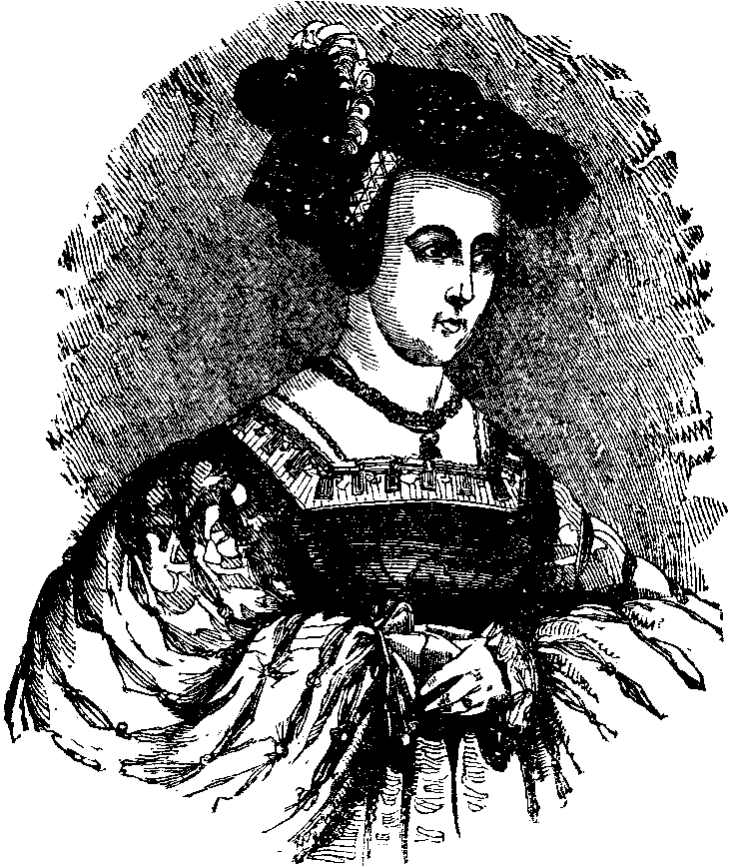
PORTRAIT OF ANNE BOLEYN

authority would annul the marriage. Thus, in a great measure, came the Reformation in England. The Catholics reproach us, and, it must be confessed, with some justice, with the ignominiousness of its origin.