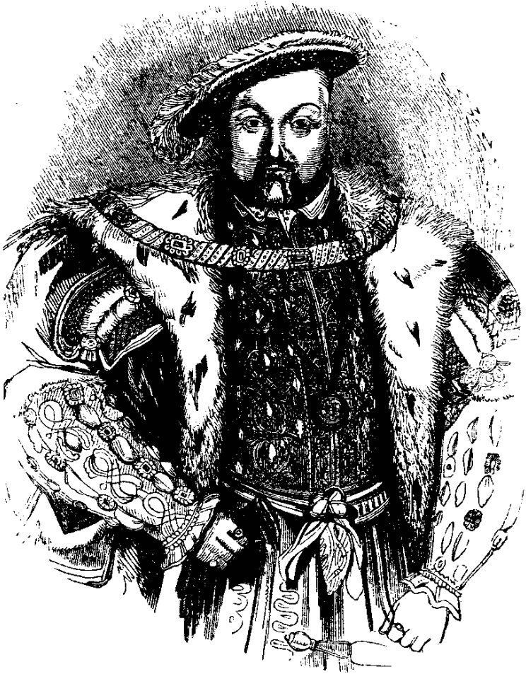
PORTRAIT OF HENRY VIII

As there were so many of them, and they figured as queens each for so short a period, they are commonly designated in history by their personal family names, and even in these names there is a great similarity. There were three Catharines, two Annes, and a Jane. The only