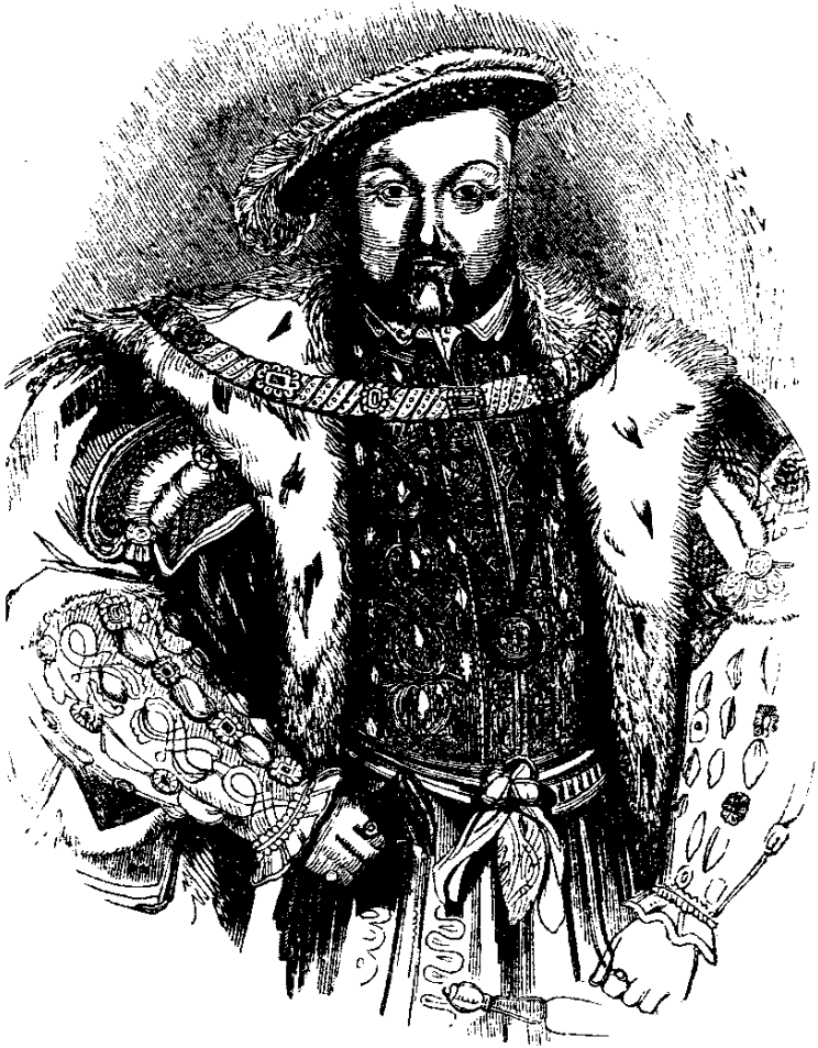
PORTRAIT OF HENRY VIII

As there were so many of them, and they figured as queens each for so short a period, they are commonly designated in history by their personal family names, and even in these names there is a great similarity. There were three Catharines, two Annes, and a Jane. The only