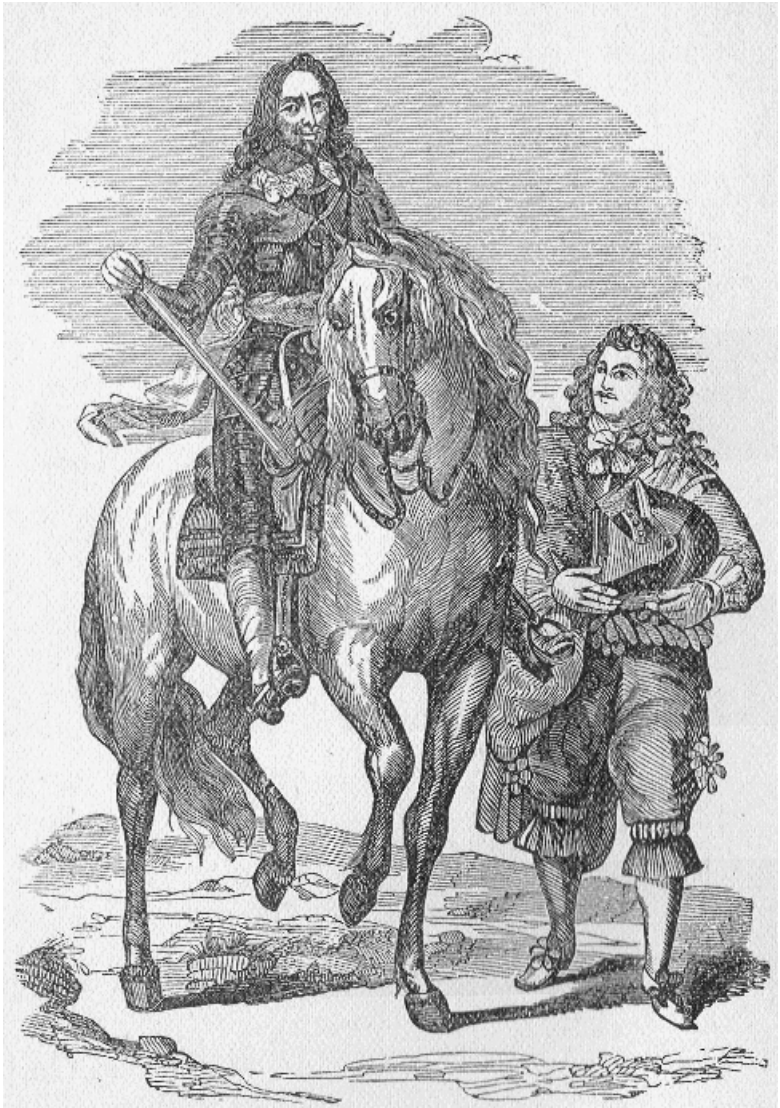
CHARLES I AND ARMOR BEARER