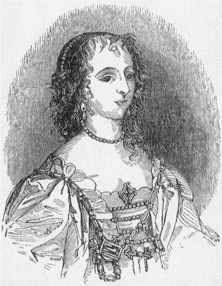
QUEEN HENRIETTA MARIA