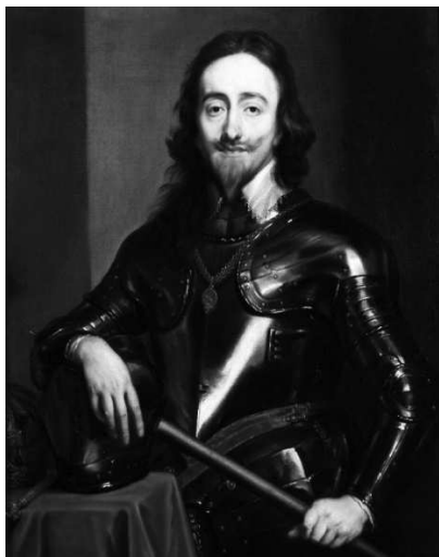
KING CHARLES I