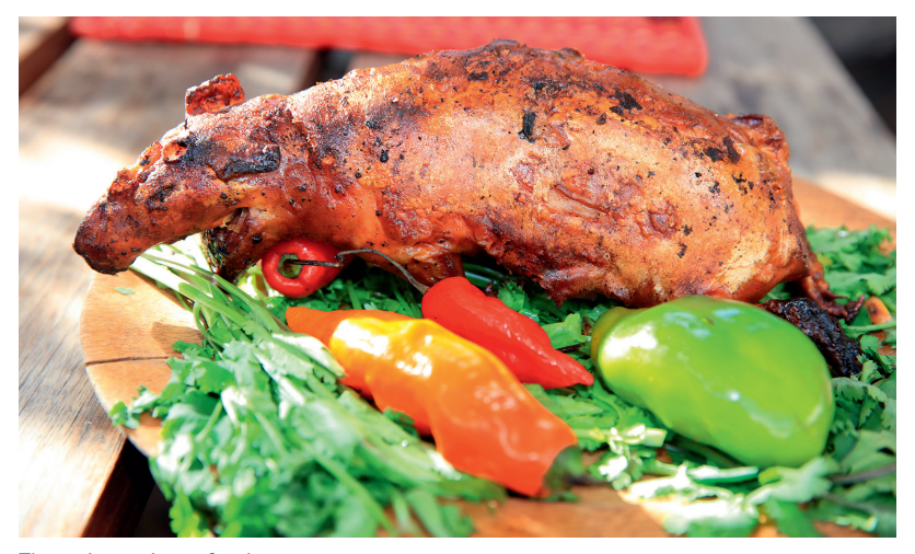
The guinea pig as food

What does a guinea pig mean to you? A cuddly pet? A guinea pig is a first pet for many children in the Netherlands. But what do you think children from Peru see in this picture? Do they see the same thing?