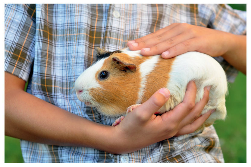
The guinea pig as a pet

What does a guinea pig mean to you? A cuddly pet? A guinea pig is a first pet for many children in the Netherlands. But what do you think children from Peru see in this picture? Do they see the same thing?