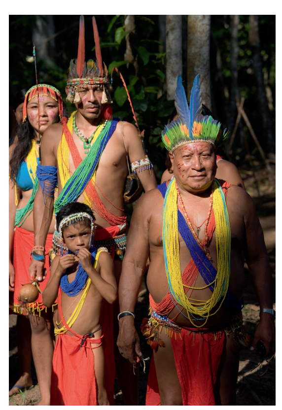
Trio tribe, indigenous inhabitants of Southern Suriname

In short, it is important to realize that a personal (cultural) identity always belongs to a group and also comes from that group.