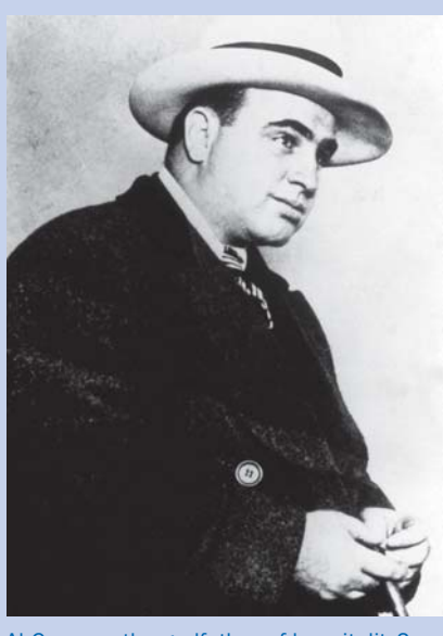
Al Capone: the godfather of hospitality?