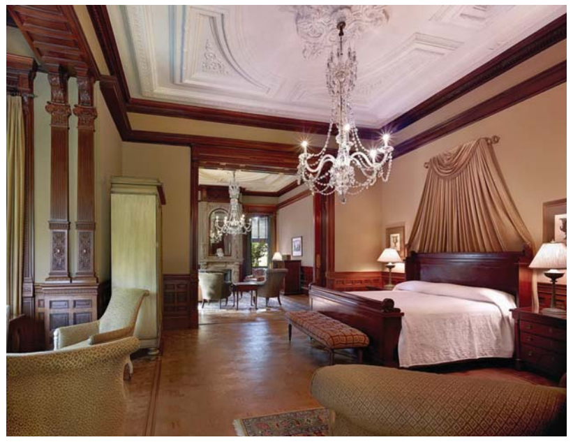
Interior of the Wentworth Mansion