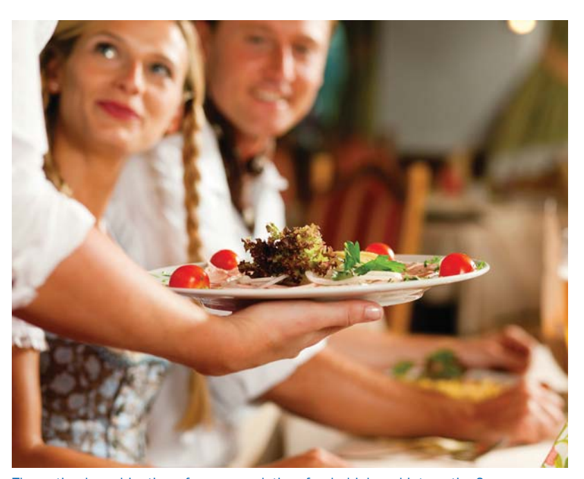
The optimal combination of accommodation, food, drink and interaction?

many key questions we need to answer to successfully manage hospitality experiences. Again, the answers require insights from other fields than just management science.