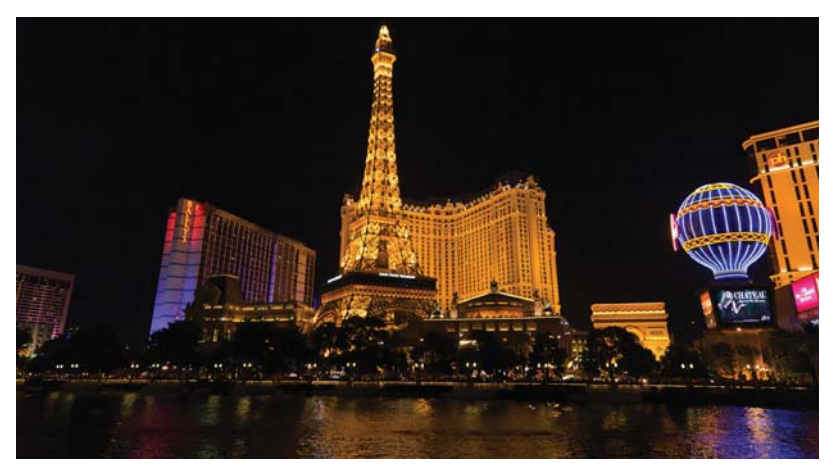
Hospitality as a means of making money?

it being an economic transaction. Goodwill, as the Greek proverb on the first page of this chapter suggests, is all very nice, but, ultimately, we are in it to make money.