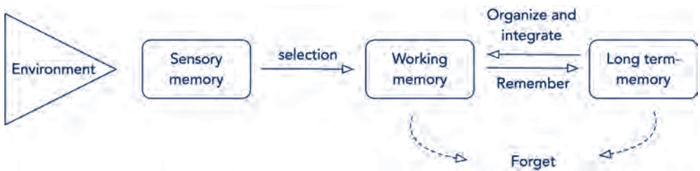
Figure 1.4 Diagram of the memory

Figure 1.4 explains the above schematically.