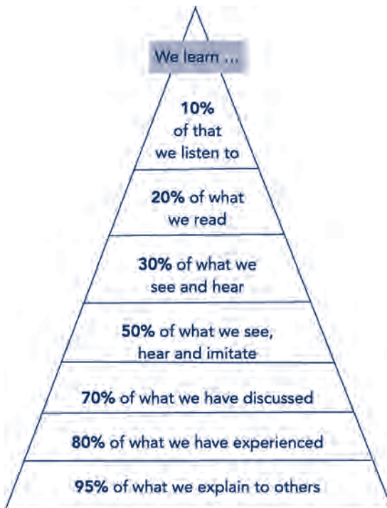
Figure 1.2 Learning pyramid of Bales

In order to design education, it is relevant to understand what learning is, especially effective learning. It is interesting for you to know that, in general, the more one ‘does’ with what one has to learn, the better one learns. In that context, the Bales learning pyramid is often quoted (see Figure 1.2).