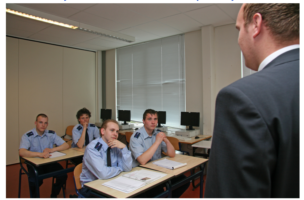
Trainee security officers not allowed to work independently

Trainee security guards cannot work on their own. However, this might be happening and this could cause problems and major consequences for training companies in the security industry. They could lose their certification. The Dutch Security Industry Association have been warned about this at the police's request.