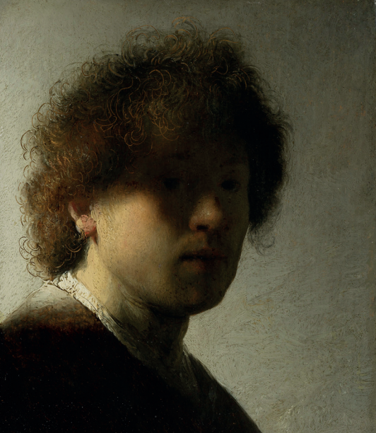
SELF-PORTRAIT AT AN EARLY AGE REMBRANDT VAN RIJN