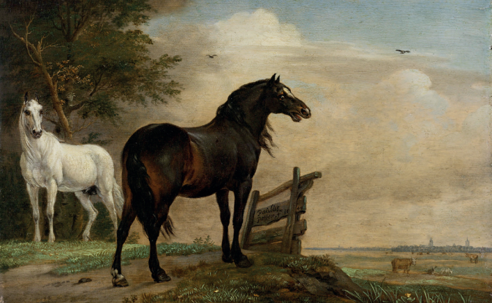
TWO HORSES IN A MEADOW NEAR A GATE PAULUS POTTER