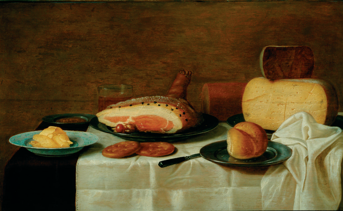
STILL LIFE WITH HAM AND CHEESE FLORIS VAN SCHOOTEN