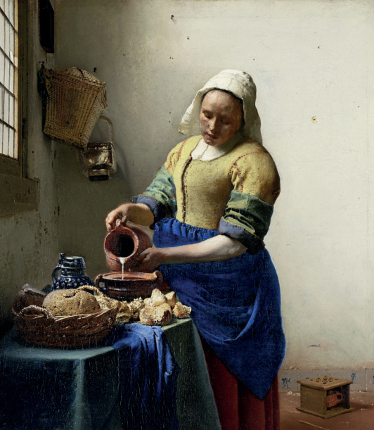
THE MILKMAID JOHANNES VERMEER