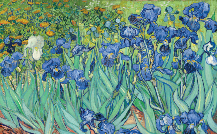
IRISES VINCENT VAN GOGH