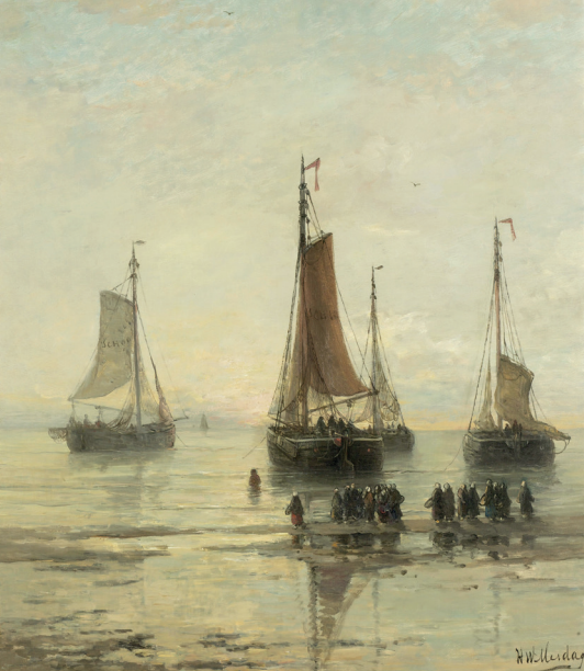
BLUFF-BOWED SCHEVENINGEN BOATS AT ANCHOR HENDRIK WILLEM MESDAG