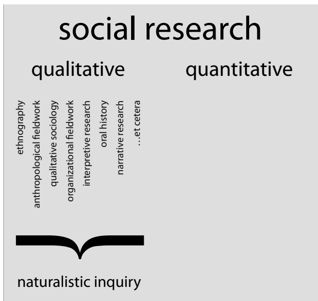
Figure 2 Place of naturalistic inquiry in social research