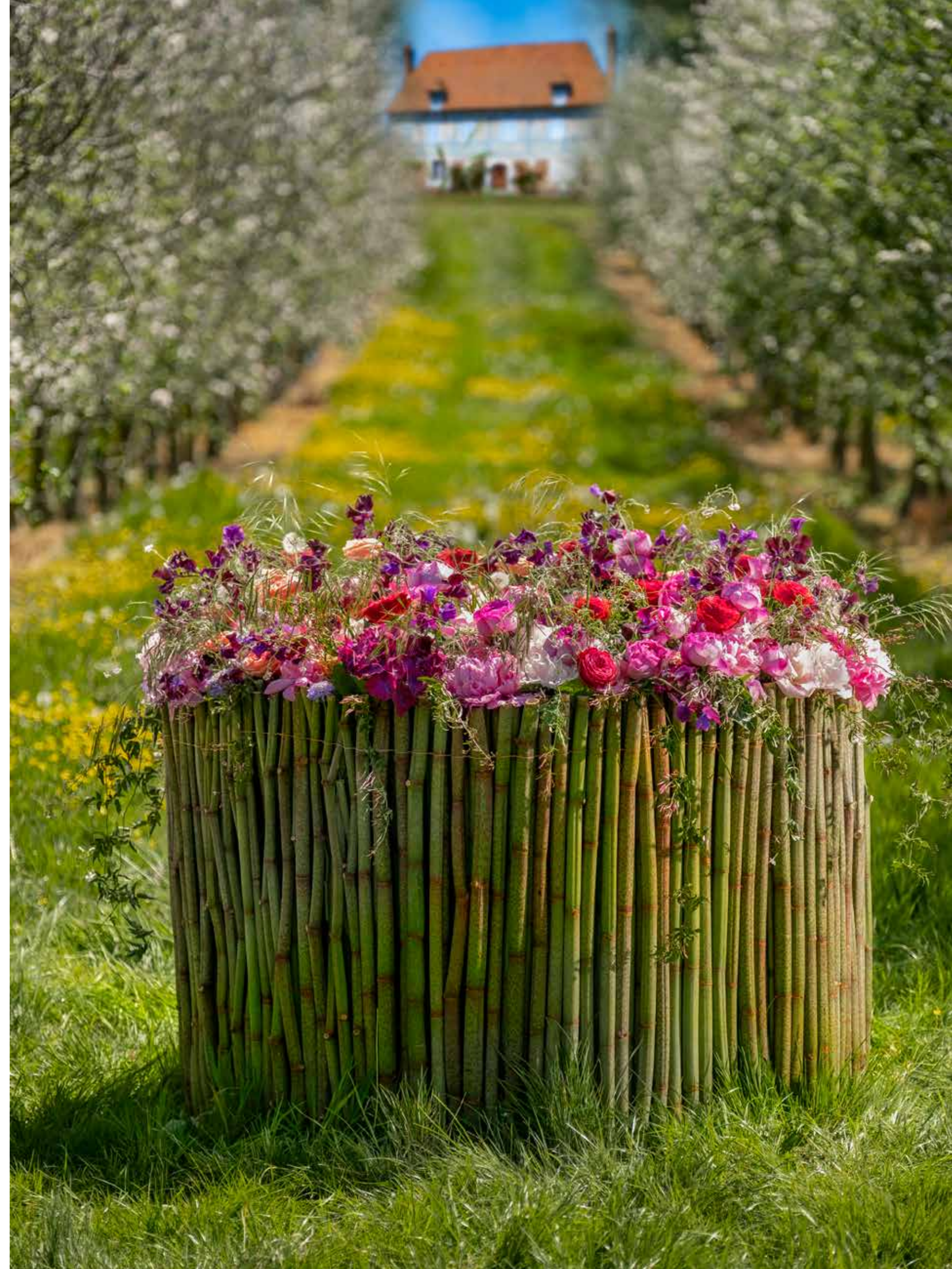
Le Cidrier des Haut-Vents, symbole de notre savoir-faire normand The Cidrier des Haut-Vents, a symbol of our Norman know-how