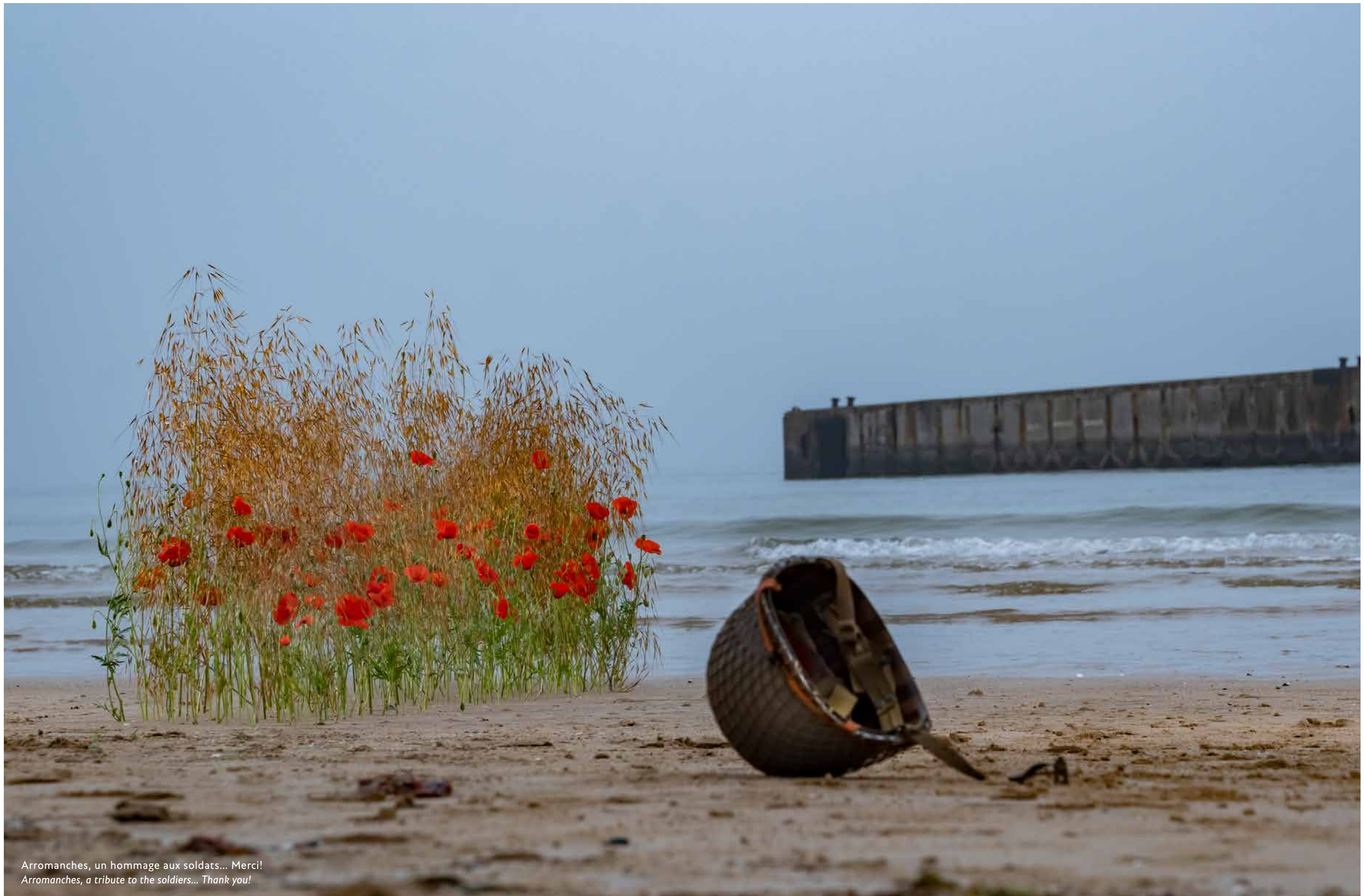
Arromanches, un hommage aux soldats... Merci! Arromanches, a tribute to the soldiers... Thank you!