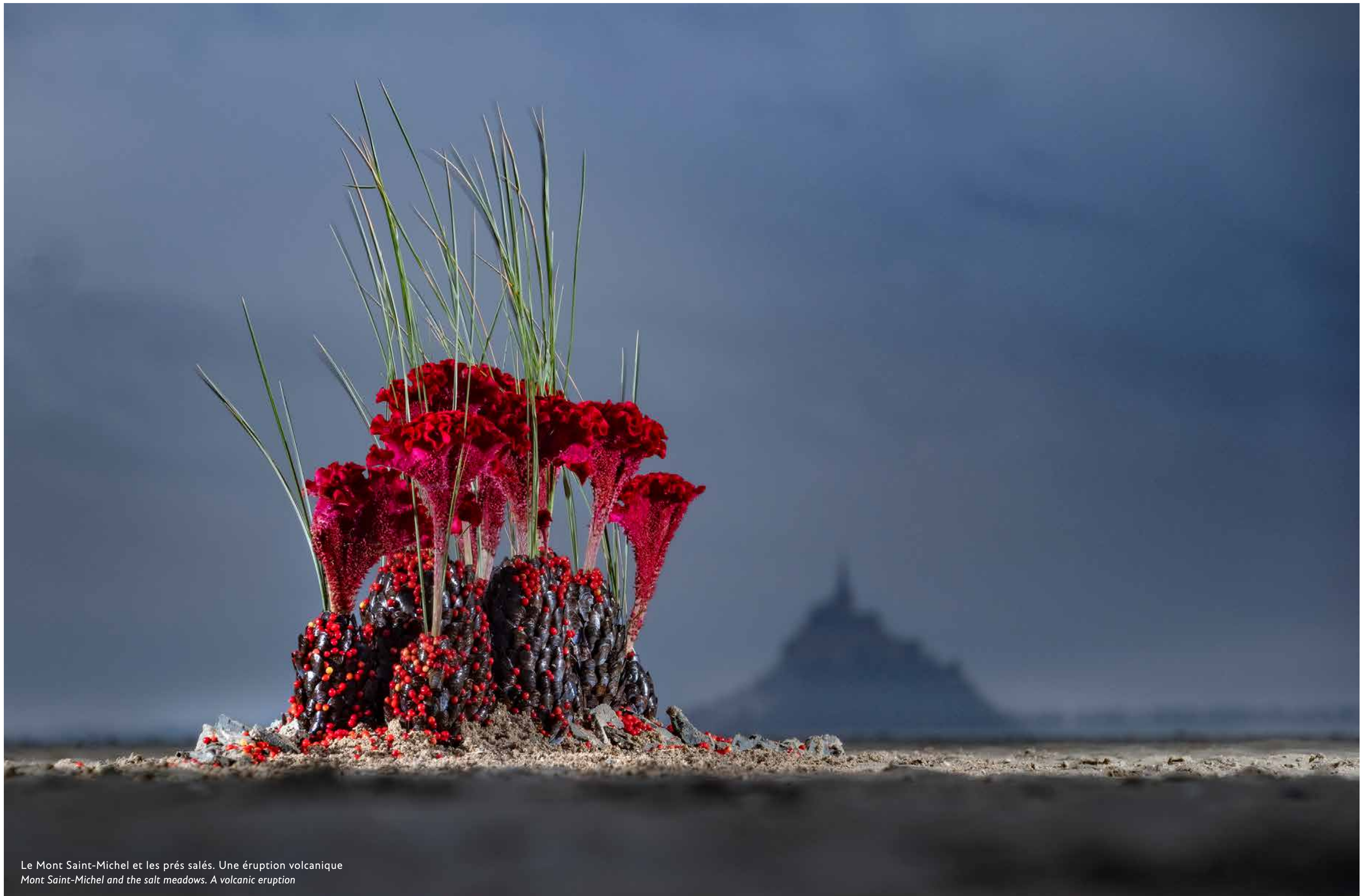
Le Mont Saint-Michel et les prés salés. Une éruption volcanique Mont Saint-Michel and the salt meadows. A volcanic eruption