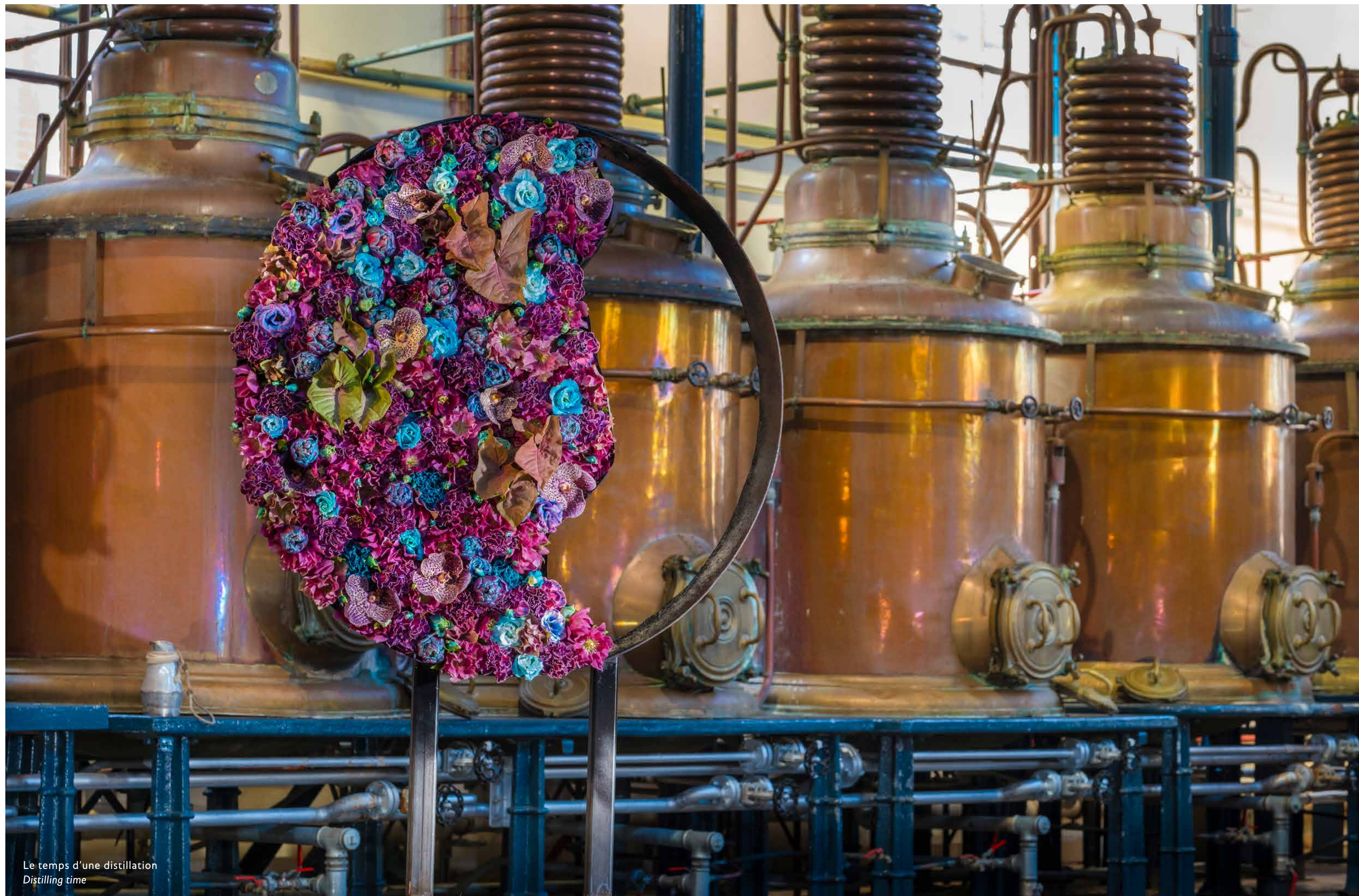
Le temps d'une distillation Distilling time