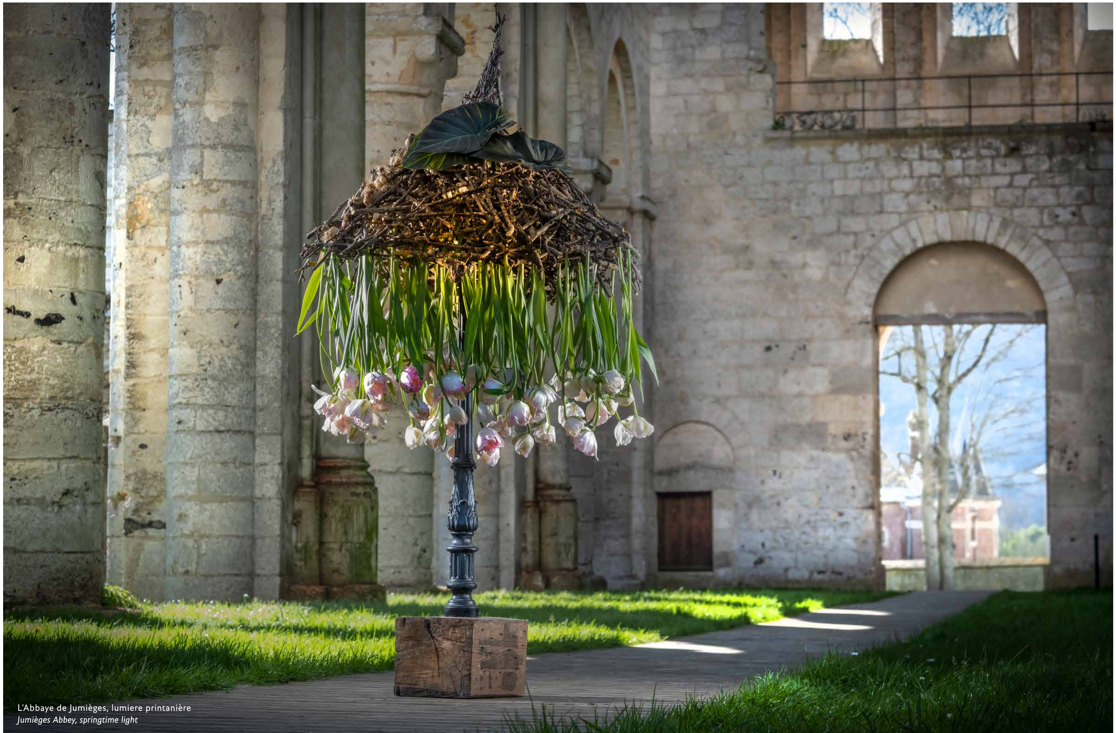
L'Abbaye de Jumièges, lumière printanière Jumièges Abbey, springtime light