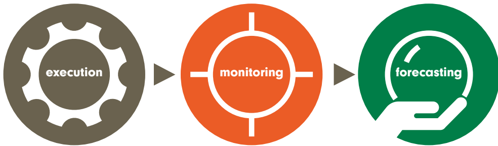
Figure 2 Testing is moving from a reactive activity (for example test execution) towards test monitoring (for example monitoring data from operating products). Eventually testing becomes the forecasting of faults.

We can create robots that can do all the testing automatically and monitor data coming from the field. The robots also have to keep up with growing amounts of test cases, test data and test environments. Tests are executed on a system under test. In that sense it is a reactive (and time consuming in the release train) activity. Testing must keep up and shift from an executing activity, to a monitoring role, towards a quality-forecasting medium that is ahead of the game.