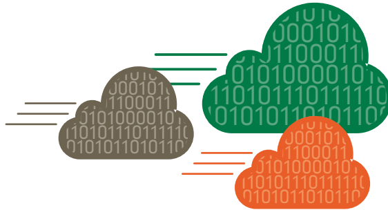
Figure 1 The digital age acts as an accelerator for all our product development activities.

Extremely high speed, huge amounts of data and an infinite amount of possibilities for integration are the elements we are facing for testing. They extend beyond our human capabilities.