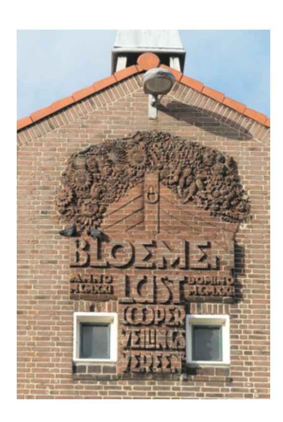
Sculpture on the façade of the Aalsmeer flower auction hall

De Klerk's talents are much less evident in this sober design. Nevertheless, it got positive press reviews and Queen Wilhelmina congratulated Michel de Klerk on the result. Very typical of De Klerk is the brick and earthenware relief on the façade representing the brow of a barge full of cut flowers with the auction's name below it along with the years 1921-1922.