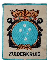
Badges for the crew.