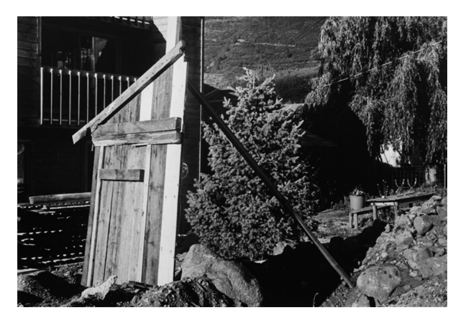
Figure 2: Gary Metz (circa 1970). Untitled, from Quaking Aspen Series. © Gary Metz Estate.

Figure 2, however, shows a photograph from a lesser known landscape photographer, Gary Metz (1941-2010). This photograph is included in a landscape series entitled Quaking Aspen: A Lyric Complaint, which was published posthumously.<sup>33</sup> While Adams' photograph presents a spectacular view of the landscape where all the visual elements are in a paradisiacal arrangement, Metz's photograph foregrounds a more commonplace facet of the landscape.<sup>34</sup> Irrespective of their approaches to the landscape, both images aim to convey the lived experiences of the photographers in their surrounding space. Referring to his work, Gary Metz notes that the concept of landscape is habitually conceived as a "pictorial one", and that is why most of the American landscapes are "visited but not lived in". 35 It is true that photographs cannot make tangible the lived experiences of landscape photographers, but to some extent they can put the spectator in relation to those experiences. As sociologist Rob Shields rightly states, "photographic 'shooting' kills not the body but the life of things, leaving only representational carcasses". 36 Evidently, photographs do not contain the phenomenological experiences of a lived body, and are merely "representational carcasses". However, through looking at them, we can comprehend how photographers chose to convey their bodily and inhabitational experiences of being in the world.