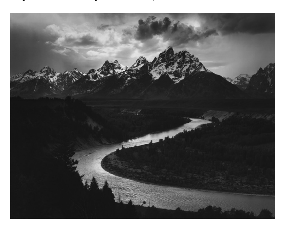
Figure 1: Ansel Adams (1942). The Tetons and the Snake River, Grand Teton National Park, Wyoming , 1942.

Taken in 1942, The Tetons and the Snake River (fig.1) is one of the most widely acknowledged photographs of American landscape photographer Ansel Adams (1902-1984). Adams' fascination with the American landscape prompted him to walk to the remotest areas of the US to visualise the splendour of American nature. Describing Adams' landscape work, photography theorist John Szarkowski once wrote, "for Adams the natural landscape is not a fixed and solid sculpture but an insubstantial image, as transient as the light that continually redefines it".<sup>32</sup>