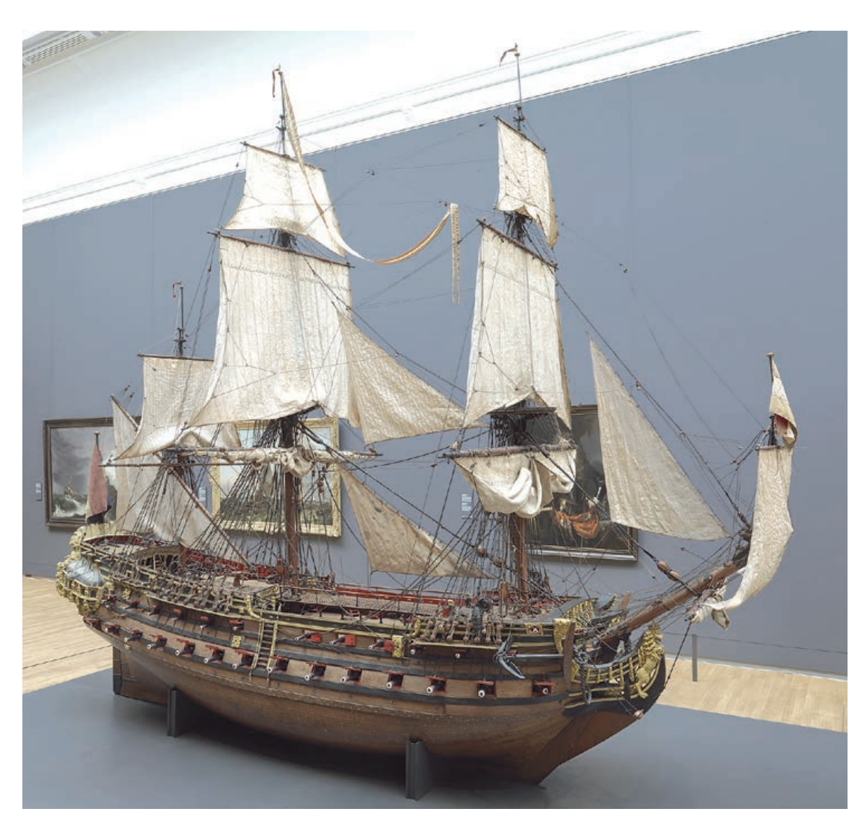
Model of a 72-gun Dutch warship, the 'William Rex'. In the eighteenth century 68 to 74 guns became the most common class for the Dutch navy's ships of the line. The model was built to decorate the Admiralty Chamber in Middelburg, 1698.

elements it is hoped that Military Power and the Dutch Republic will contribute to the broader historical debate and so interest a wider audience in the military factor in the Republic's rise and fall.