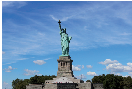
📎 attachment 1