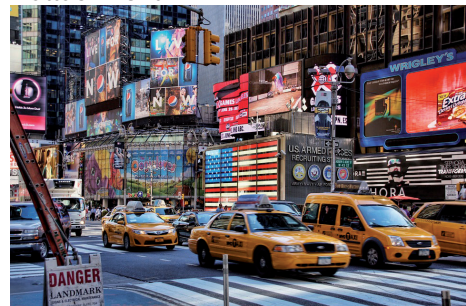
📎 attachment 2