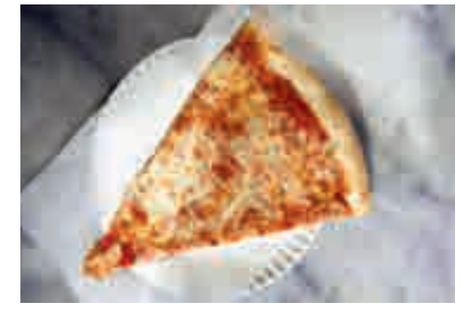
▲ You can't visit NYC without eating a slice of pizza . My favourite pizza place is located in the heart of Nolita on Prince Street. The pepperoni pizza is to die for!