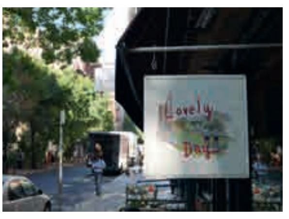
▲ Lovely day is one of the cheapest downtown restaurants that serves great Thai-ish food. Their 'Pad Thai' is delicious and so is the green curry. It always has a cool crowd and the restaurant is super charming. I like to come here during the week.