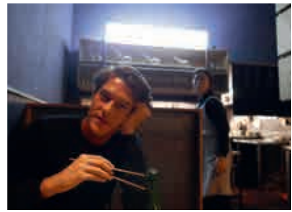
▲ Atoboy has a cool decor and serves great Korean cuisine with a modern touch: fun, creative and delicious. I really love this place. The staff is very friendly and the vibe is great. There is no à la carte option, so it's a 'prix fixe deal' with your choice of three dishes and a side of rice for $42. Don't get any fancy cocktail (not that great) just get a small bottle of Soju to go for the ultimate Korean experience. Don't forget to order the Korean fried chicken!