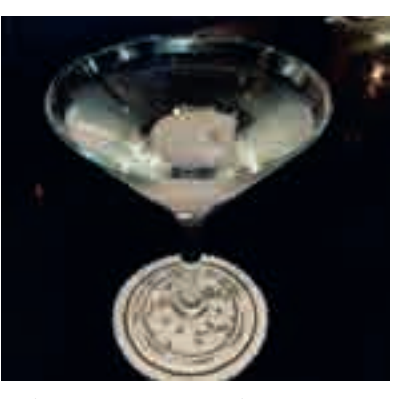
▲ This is not your average Chinese restaurant. Mr Chow is a New York classic. I love this restaurant; women put on their highest heels and men wear their nicest outfits; this restaurant has a beautiful atmosphere and serves delicious Chinese cuisine. TIP: Keep those lychee martinis coming!