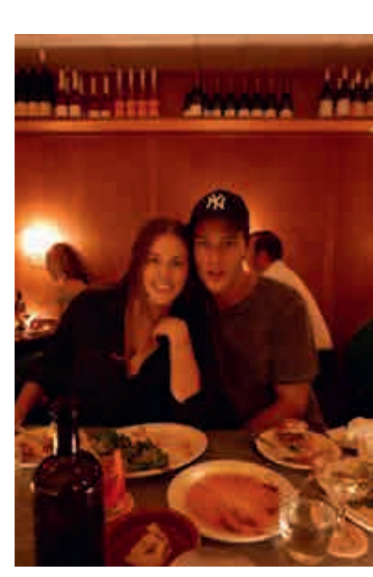
▲ Cervo's is another great spot for dinner.

• Sake Bar Decibel is one of my favourite secret gems in the city. It's the coolest sake bar I've ever been to and a bit hidden. You have to descend a set of steps under the flashing "On Air" sign in East Village. When you enter this place you don't feel like you're in NYC at all, but in Tokyo. Sake Bar Decibel is a rough and rowdy sake bar, with blasting music and full of graffiti walls. Super cool! They serve over 100 different great rice wines. Such a unique and fun experience.