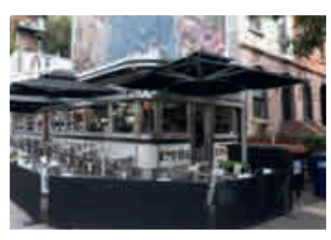
▲ Empire Diner is a NYC classic. I have a huge love for American diners, they remind me of Hollywood movies. This diner serves great food and besides from the typical diner cuisine they also have some healthy options. I love their daily fresh made soups and their mac 'n cheese is YUM.