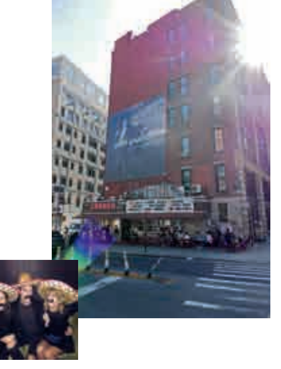
La Esquina is a Mexican restaurant. You need to enter the place through the above "walk in restaurant". When walking down the stairs you pass by the kitchen and enter a great dark sexy restaurant in the basement. The food is yummy and the vibe is unique. A fun restaurant to go to before going out. Try the spicy margarita.