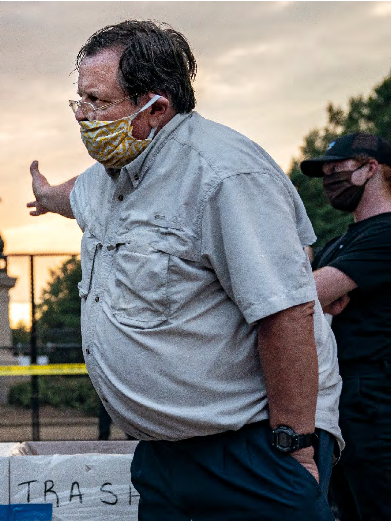
Evelyn Hockstein, United States, for The Washington Post, 1st Prize Spot News