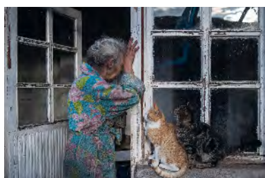
VALERY MELNIKOV Paradise Lost