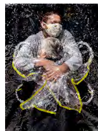
MADS NISSEN The First Embrace