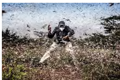
LUIS TATO Fighting Locust Invasion in East Africa