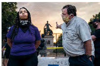
Emancipation Memorial Debate