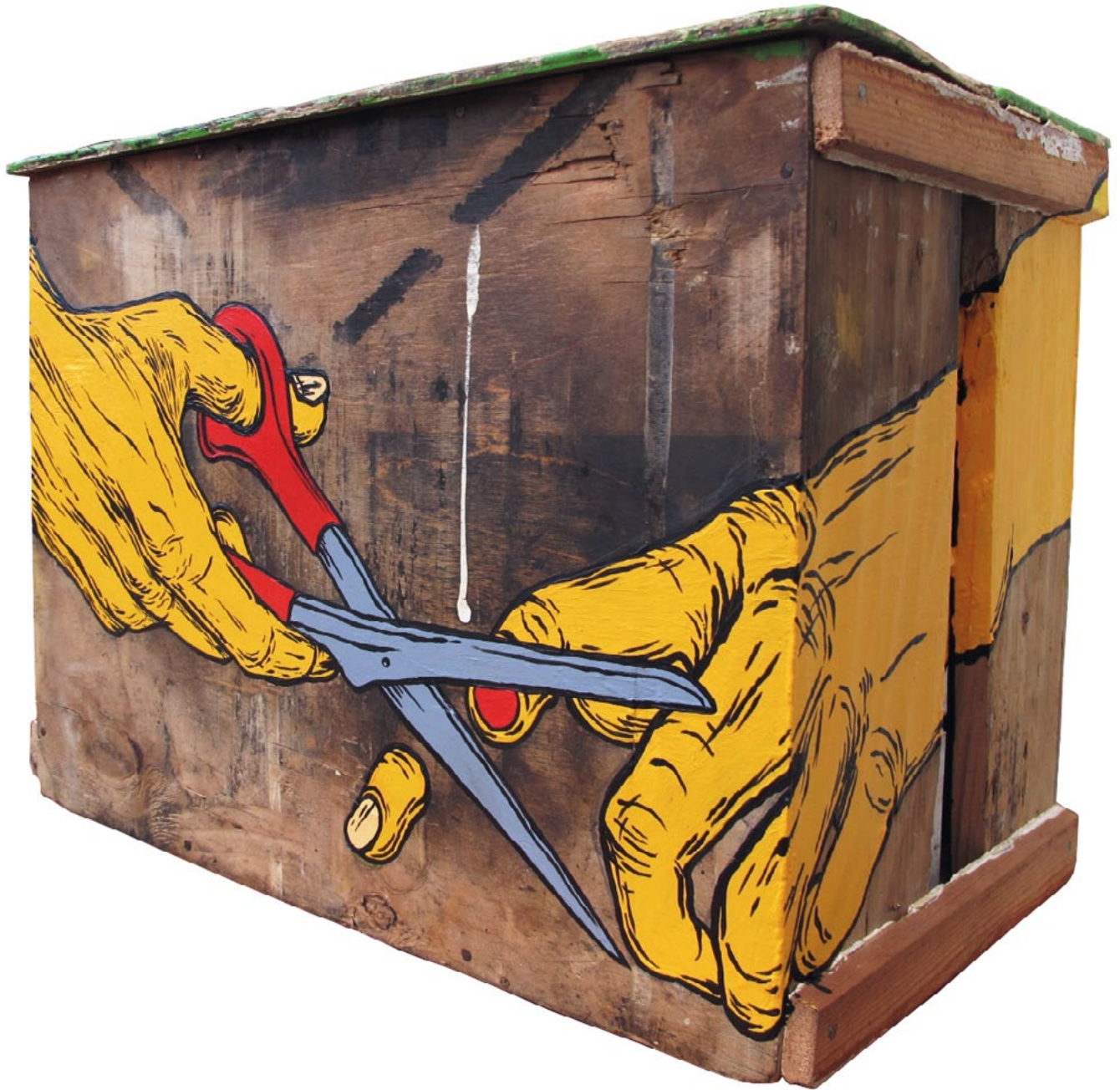
'Inside Job' group show, The Helena Rubinstein pavilion, Tel Aviv Museum