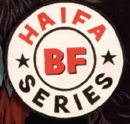
Acrylic on wood panels, 150 x 250 cm. The work was first presented at the Haifa Museum