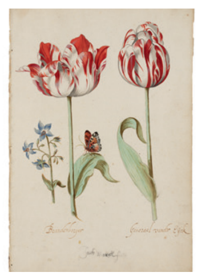
Fig. 01 Jacob Marrel (DE, 1614–1681), Two tulips: the Brandenburger and the General van der Eijck, c.1634–1681, drawing, 34.3 cm x 45.5 cm, Teylers Museum, Haarlem, inv. no. T 083b.

The Early Modern popularity of flowers is also reflected in the arts. Beginning in the sixteenth century, a new genre of painting began to flourish in the Low Counties (Holland and Flanders), that became particularly popular in the seventeenth century: the floral still life or flower piece. Painting flowers was part of the traditional training of Dutch painters. By being able to convey the right coloration, contours and textures of