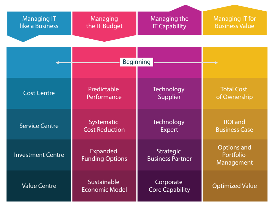
FIGURE 3: MAJOR STRATEGIES OF IT-CMF'S MACRO CAPABILITIES

When an organization is planning its capability improvement programme, it is helpful to decide on its strategic objectives in relation to each of the four macro-capabilities of IT-CMF, as depicted in Figure 3. This will help to identify the critical capabilities that the organization needs to focus on. Other factors that must be taken into account include IT posture, problem context, industry trends, business strategy, business context, and so on. (For further discussion of this topic, see [14][32].)