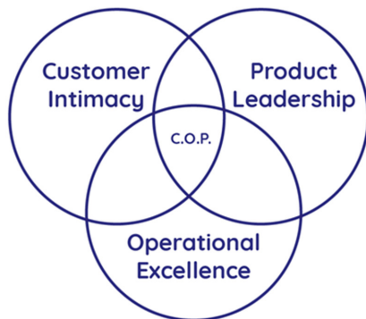
Figure 1 – Competitive strategies

Treacy and Wiersema have described three generic competitive strategies that help organizations to develop an appropriate strategic and operational plan: Operational Excellence, Customer Intimacy and Product Leadership.