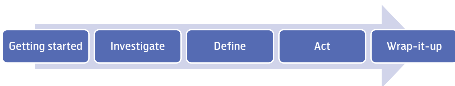
Figure 2 The project life cycle

The book's chapters follow the phases of a simple project life cycle: