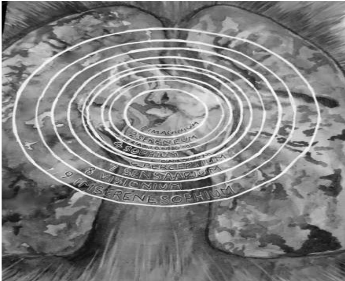
Painting: Jessie May Peters: Front Cover: First Edition

Thesis always arises as a necessary response to already existent antithesis; however, a thesis is, always, translated and transformed into reality not as the thesis but what it becomes, a synthesis, because many a mind get involved in its translation, interpretation, transformation and implementation by contributing to it their imagination, ingenuity and creativity, quality of which is, always, determined by the level, degree and magnitude of their learning, education, illumination, enlightenment, vision and wisdom.