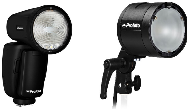
To the left: a Profoto-unit with a lot of power, but also designed for on-camera flash. On the Right: almost the same size but this one has to be connected to a larger battery and packs a lot of power.

Let's first take a look at some examples of what you can buy nowadays that could be labeled "small flash."