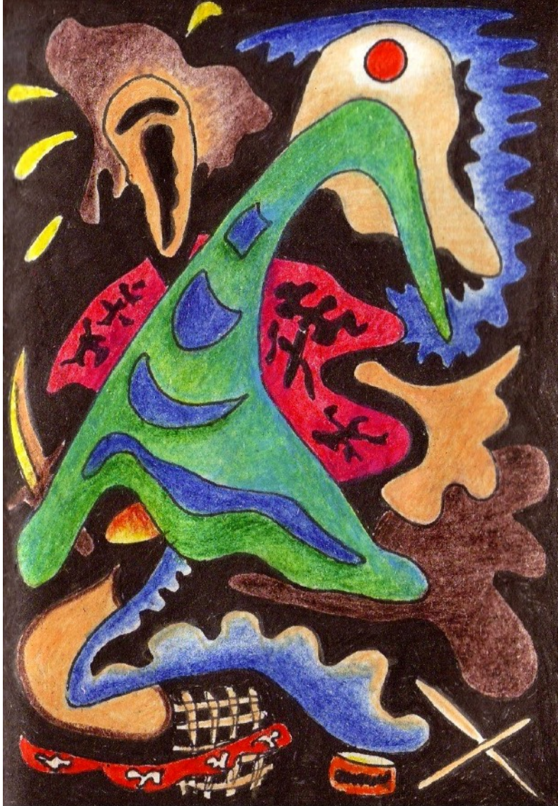
"The Wind-Up Bird Chronicle" Haruki Murakami.