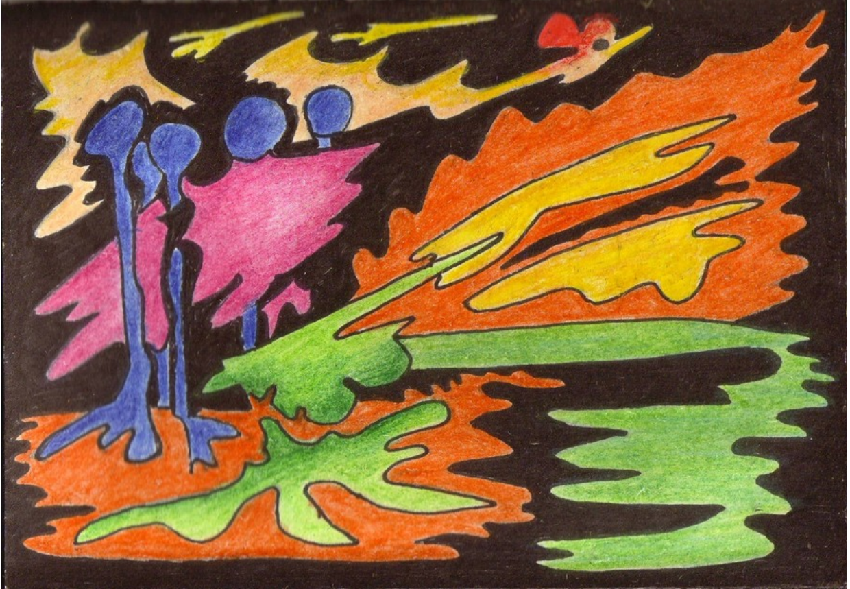
A Flying Rooster