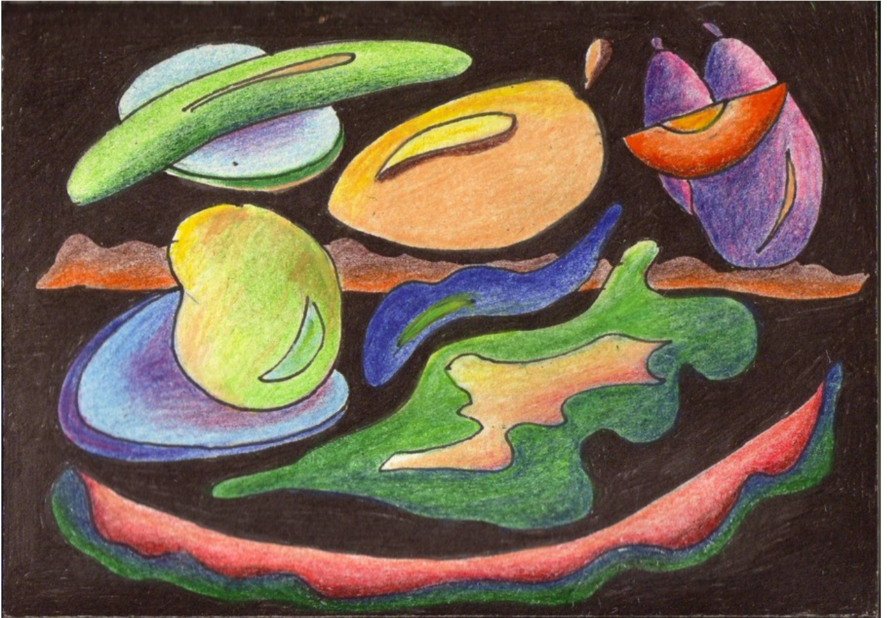
A Still Life