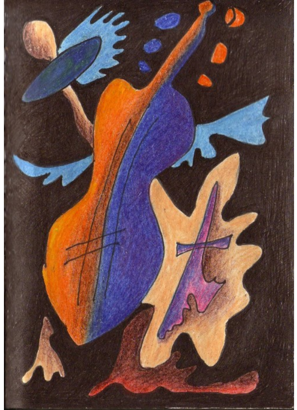
In the Bass Key