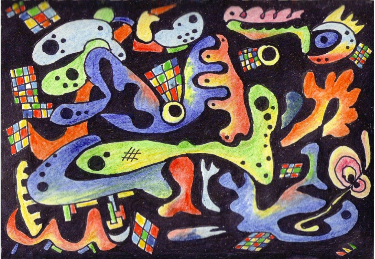
The game of light