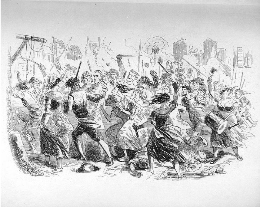
A photograph of an engraving in The Writings of Charles Dickens volume 20, A Tale of Two Cities, titled "The Sea rises".