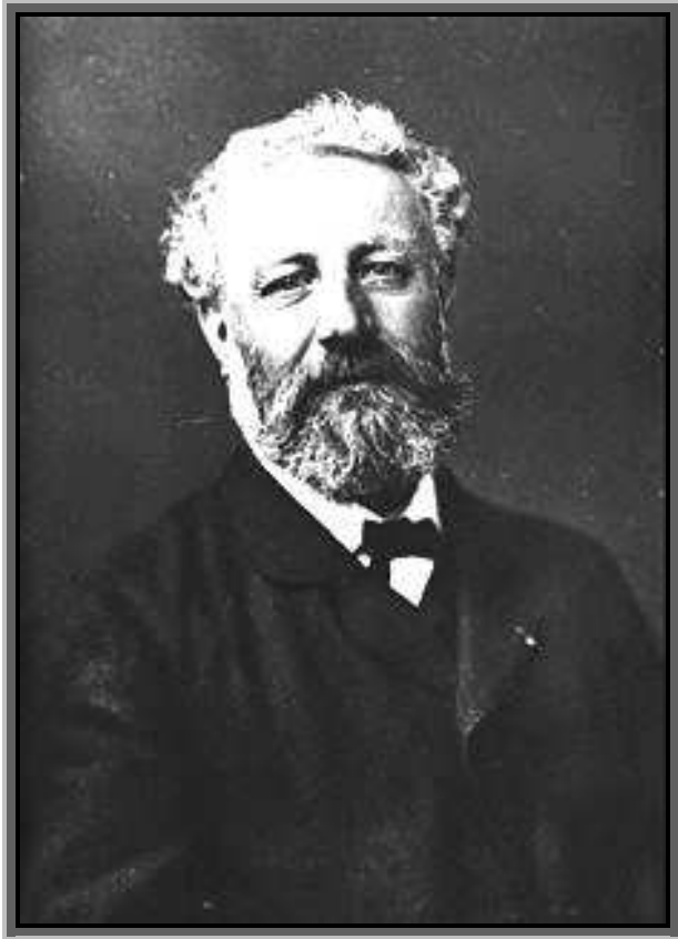
Jules Verne (1878)

Jules Gabriel Verne (1828 – 1905) was a French novelist, poet, and playwright best known for his adventure novels and his profound influence on the literary genre of science fiction.