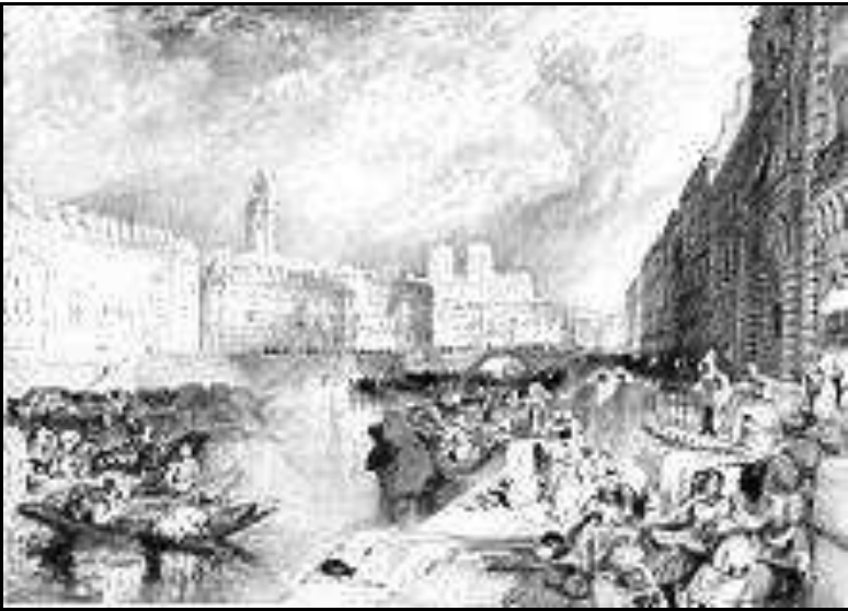
Nantes from Île Feydeau, around the time of Verne's birth

Born to bourgeois parents in the seaport of Nantes, Verne was trained to follow in his father's footsteps as a lawyer, but quit the profession early in life to write for magazines and the stage. His collaboration with the publisher Pierre-Jules Hetzel led to the creation of the Voyages Extraordinaires , a widely popular series of scrupulously researched adventure novels including Journey to the Center of the Earth , Twenty Thousand Leagues Under the Sea , and Around the World in Eighty Days .