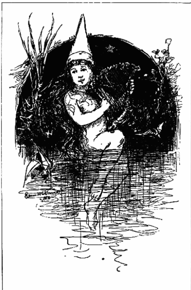
THE LITTLE "NECK" IN THE SWEDISH RIVER.