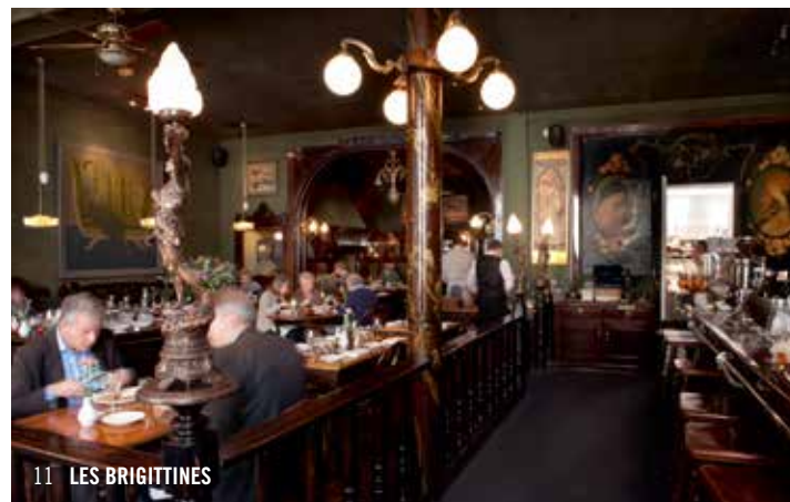
11 LES BRIGITTINES

This is a friendly, relaxed restaurant with authentic Brussels charm. A great place to go with kids: its walls are decorated with quirky comic-book murals illustrating episodes from Belgian history. The cooking is Belgian style with classics like moules-frites , beef stewed in Belgian beer and saucisse-stoemp (sausage with mashed potatoes). The menu lists interesting Belgian beers, along with Belgian Cécémel (chocolate milk) for the young ones.