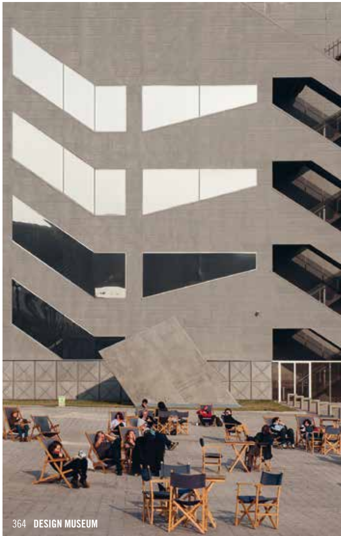
364 DESIGN MUSEUM