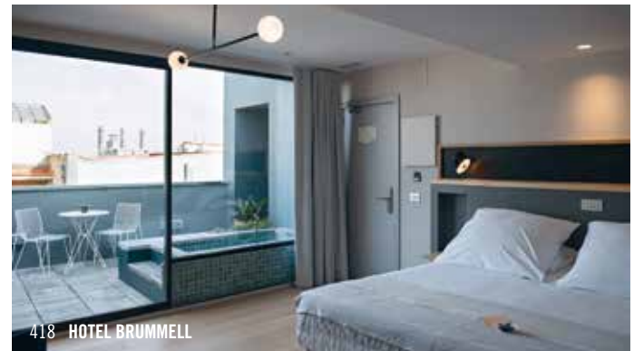
418 HOTEL BRUMMELL

Named after the Arab bathhouse that used to be here, Banyes Orientals is an up-to-date, stylish hotel, with small rooms in simple colours. Located in the Born, which means enormous amounts of tourists during the day but no traffic at night. The number of great restaurants, coffee houses and clothes stores in the immediate vicinity is enormous.