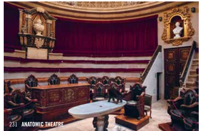
231 ANATOMIC THEATRE