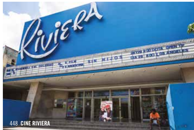
448 CINE RIVIERA

This multiplex has four modern cinemas. An important venue during the international film festival in December. In Cuba going to the cinema is a real experience, because Cubans express their emotions during the film. They laugh, are frightened, tell the characters what they should do, reflect on what's not done. In short, they comment on every bit of the film without being disruptive. It's like interactive cinema, but more fun.