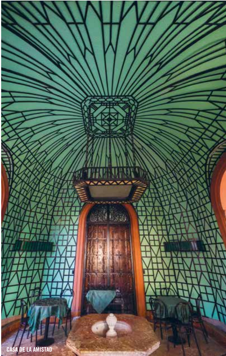
CASA DE LA AMISTAD