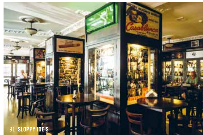
91 SLOPPY JOE'S

Bar Dos Hermanos is located opposite Sierra Maestra terminal. This mojito bar was recently renovated. Hemingway also frequented this bar. Other important guests were Frederico Garcia Lorca and Marlon Brando. Open 24/7.