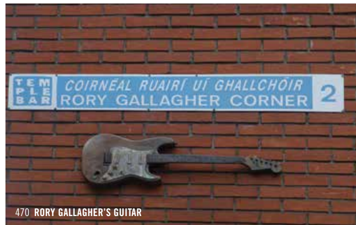
470 RORY GALLAGHER'S GUITAR

Even Jimi Hendrix was in awe of blues musician Rory Gallagher. He gave everything he had when playing, so much so that rumour has it he actually sweated off the paint job on one of his first guitars. This commemorative Fender is in pretty good nick though. If you don't know his stuff, check out the songs Crest of a Wave and A Million Miles Away . Stunning.