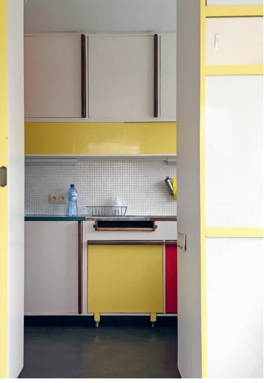
Menegemlei 23, Renaat Braem (1958)

the building originally also had a roof garden, which later had to be removed due to leaks.