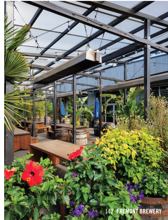
142 FREMONT BREWERY

This small, charming cafe and bakery on Alki Avenue is a great place to get off your feet if you've been busy swimming or walking Alki Beach. They have plenty of tables set up out front across the road from the beach where you can enjoy one of their daily pastry specials and a seasonal drink, like a rosewater cardamom latte.