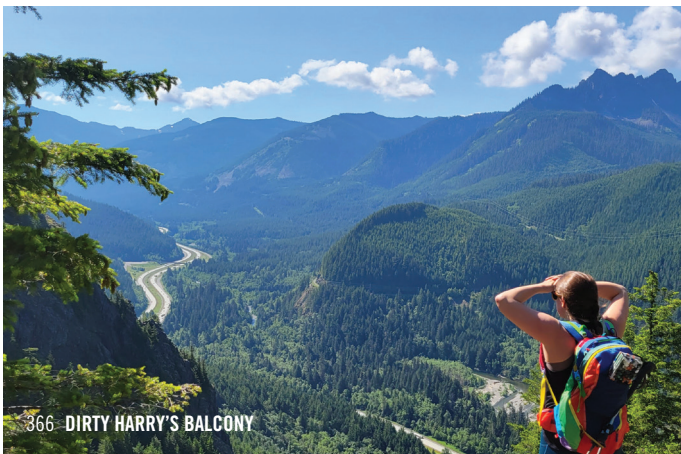
366 DIRTY HARRY'S BALCONY

Looking to get out of the city for a half a day or less to a hike with some scenic views? Interested in a hike that's short but will still leave you a little winded and sore from a great workout? Check out Dirty Harry's Balcony, just under 40 miles from downtown Seattle. This hike makes a great pairing with other activities in the North Bend or Snoqualmie areas.