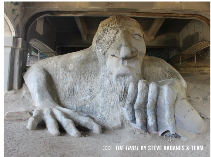
332 THE TROLL BY STEVE BADANES & TEAM

Tens of thousands of commuters and travelers pass over the Aurora bridge on a daily basis, rarely giving thought to the spooky troll that lurks right beneath the northern end of the bridge. Cemented in pop culture thanks to the film 10 Things I Hate About You , the troll was constructed in 1990. It is 18 feet tall and clutching a Volkswagen Beetle.