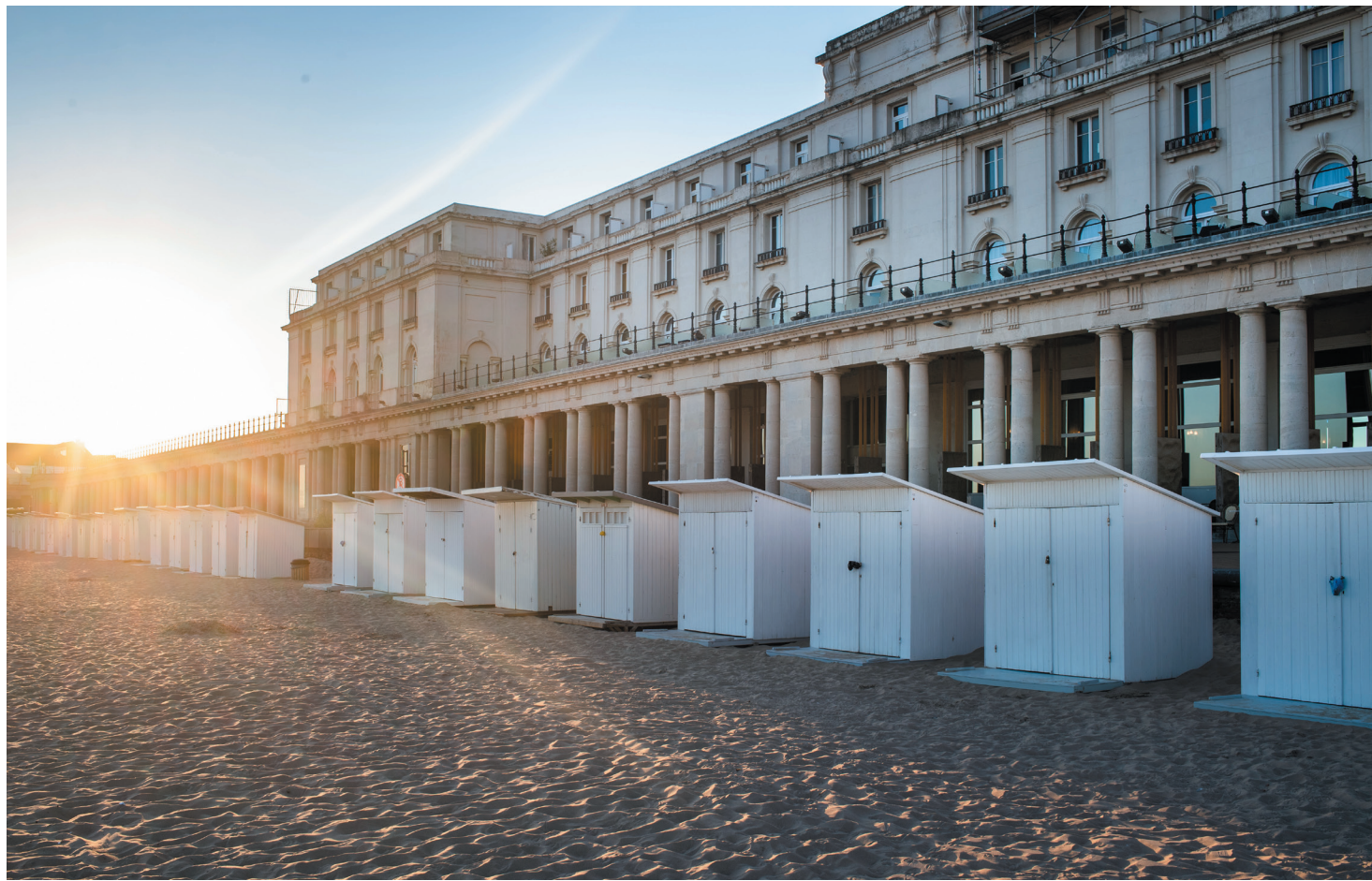
► The façade of the Thermæ Palace in the 1950s.