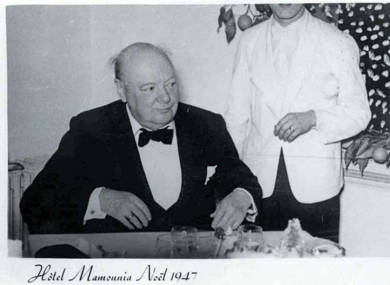
Hôtel Mamounia Noël 1947

ALFRED HITCHCOCK filmed several scenes of his 1956 film, The Man Who Knew Too Much , at the hotel.