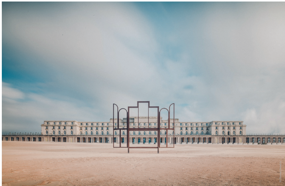
► Ostend's sandy beach with the Thermæ Palace Hotel in the background around 1935.