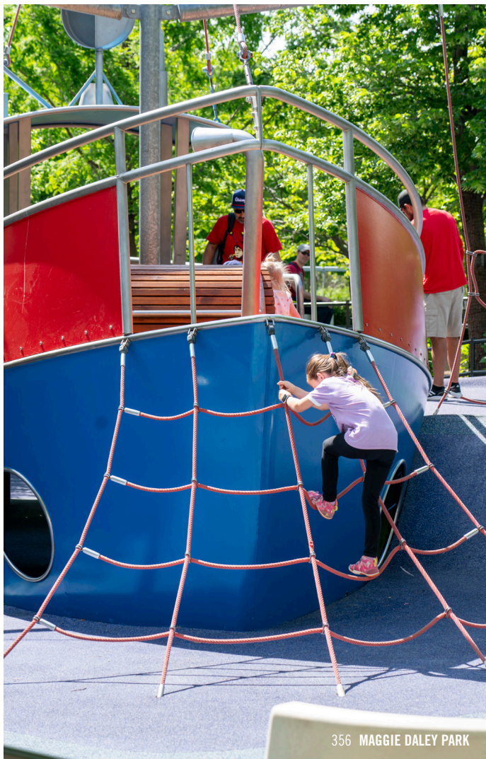
356 MAGGIE DALEY PARK