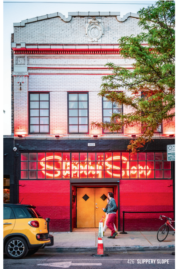
426 SLIPPERY SLOPE

This old-school Polish bar started heating up a few years ago when a handful of young creatives began hosting monthly dance parties dubbed the Podlasie Pleasure Club. Now fully revived, Podlasie hosts a mix of long-established and emerging DJs most nights of the week, spinning everything from techno-house to early 2000s UK dubstep.