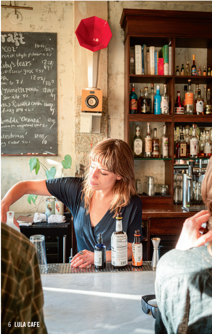
6 LULA CAFE