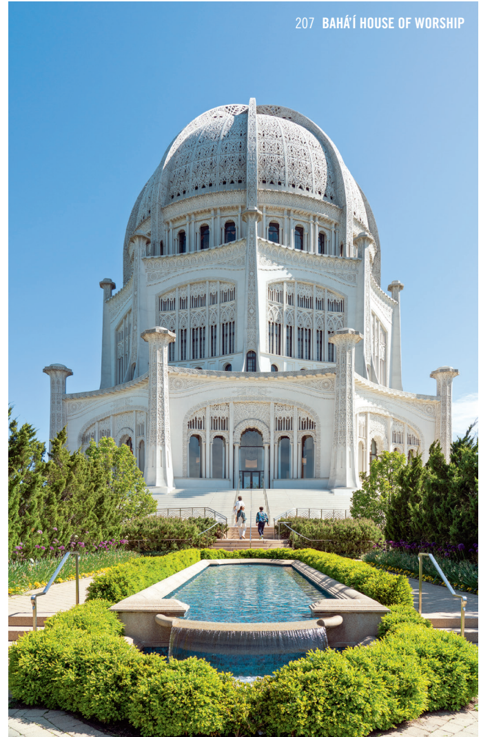
207 BAHÁ'Í HOUSE OF WORSHIP

One of just 14 Bahá'í temples in the world (and the only one in the United States), this intricate, dome-roofed structure was designed by Louis Bourgeois and completed in 1951 after 30 years of construction. In accordance with the Bahá'í style, the nine-sided temple is surrounded by a series of nine pathways, all of which are surrounded by nine gardens.