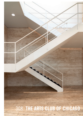
308 THE ARTS CLUB OF CHICAGO