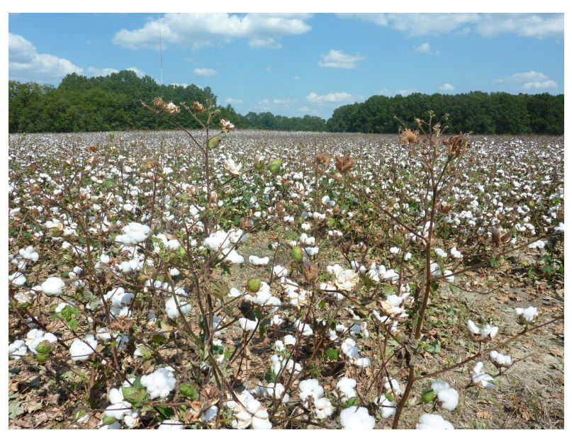
Cotton is blooming in the Mississippi Delta

The state of Mississippi is named after the mighty Mississippi River which defines the western border of the state. The river is also responsible for the characteristic landscape of the state, the wide river delta marking the western part of Mississippi. The Delta plays an important role in Mississippi history: its fertile soil fed extensive cotton fields, cultivated by enslaved people originally brought from Africa. This set the stage for the birth of the blues as well as many landmark events in American civil rights history.