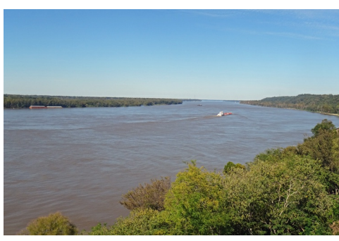
Mississippi River at Natchez

The Mississippi is the second-longest river in the US after the Missouri River (which actually flows into the Mississippi). Its source is at Lake Itasca in Northern Minnesota and the river travels for 2318 miles/3730 km where it flows into the Gulf of Mexico. The name is of Native American origin: Misi-ziibi ("absorbing all waters") because the Mississippi is fed by hundreds of tributaries in a watershed that stretches from the Rocky Mountains in the west to the Appalachians in the east. For thousands of years, Indige-