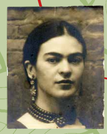
Unknown photographer, Frida Kahlo , 1931, photo, 5.6 x 4.5 cm, Museo Dolores Olmedo, Mexico