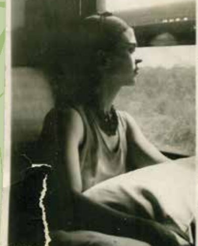
Unknown photographer, Frida Kahlo, c. 1933, photo, 8 x 5.2 cm, Museo Dolores Olmedo, Mexico

Nickolas Muray (1892-1965), Frida Kahlo with artist and ethnologist Miguel Covarrubias, 1938, photo, 10.8 x 14.7 cm, Museo Dolores Olmedo, Mexico