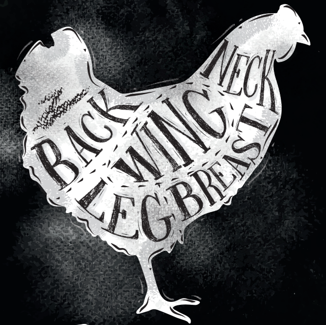
- Chicken -