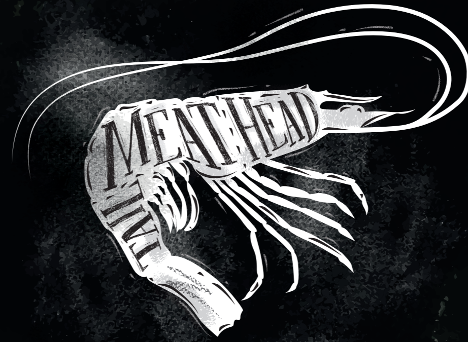
- Shrimp -