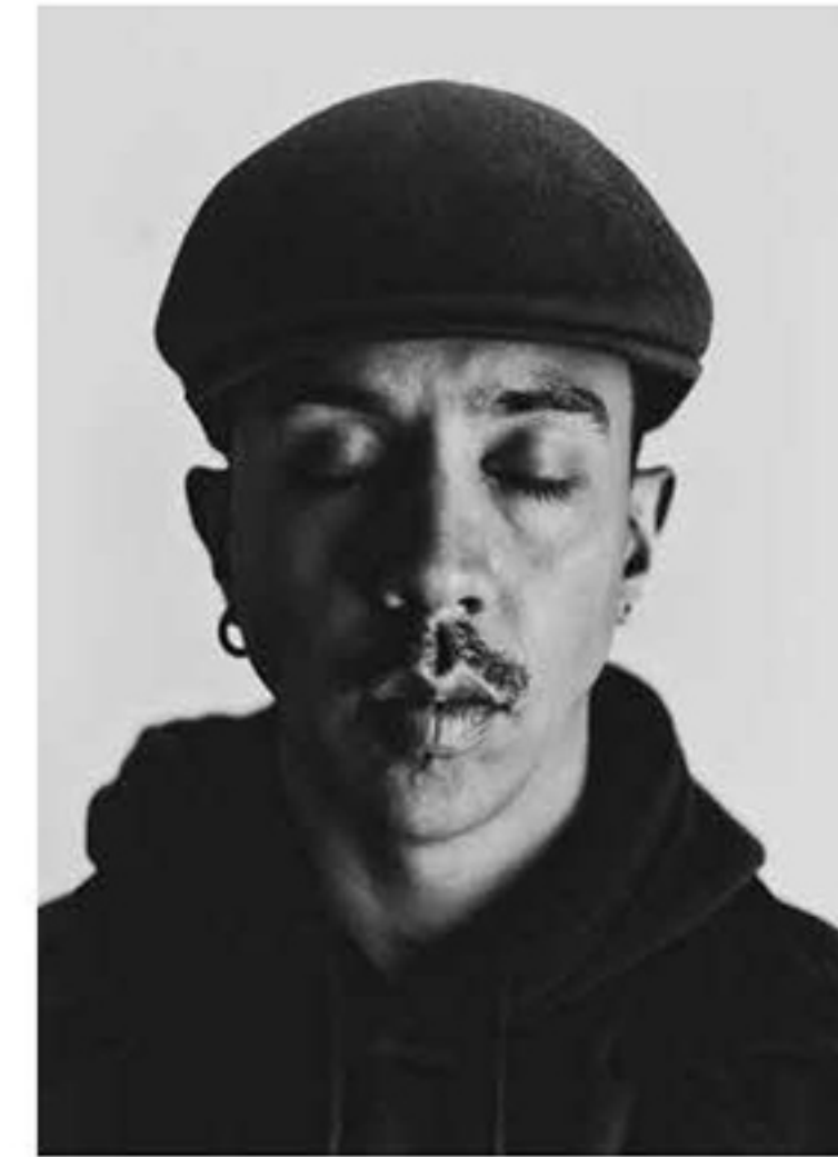
Full name, Profession