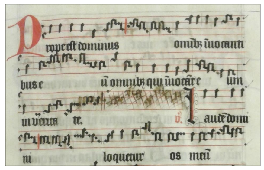
Figure 1. LEIDEN UNIVERSITY LIBRARY BPL 3683, detail of fol. XIr.

Like many others, St Agnes' manuscripts were scattered or destroyed in those turbulent times, but this particular book survived, and eventually found repose at Leiden's University Library. There, in an atmosphere not unlike that of the former monastery, one can simultaneously admire the dedicated work of its first author and be horrified at the crude alterations of the unknown scribe.