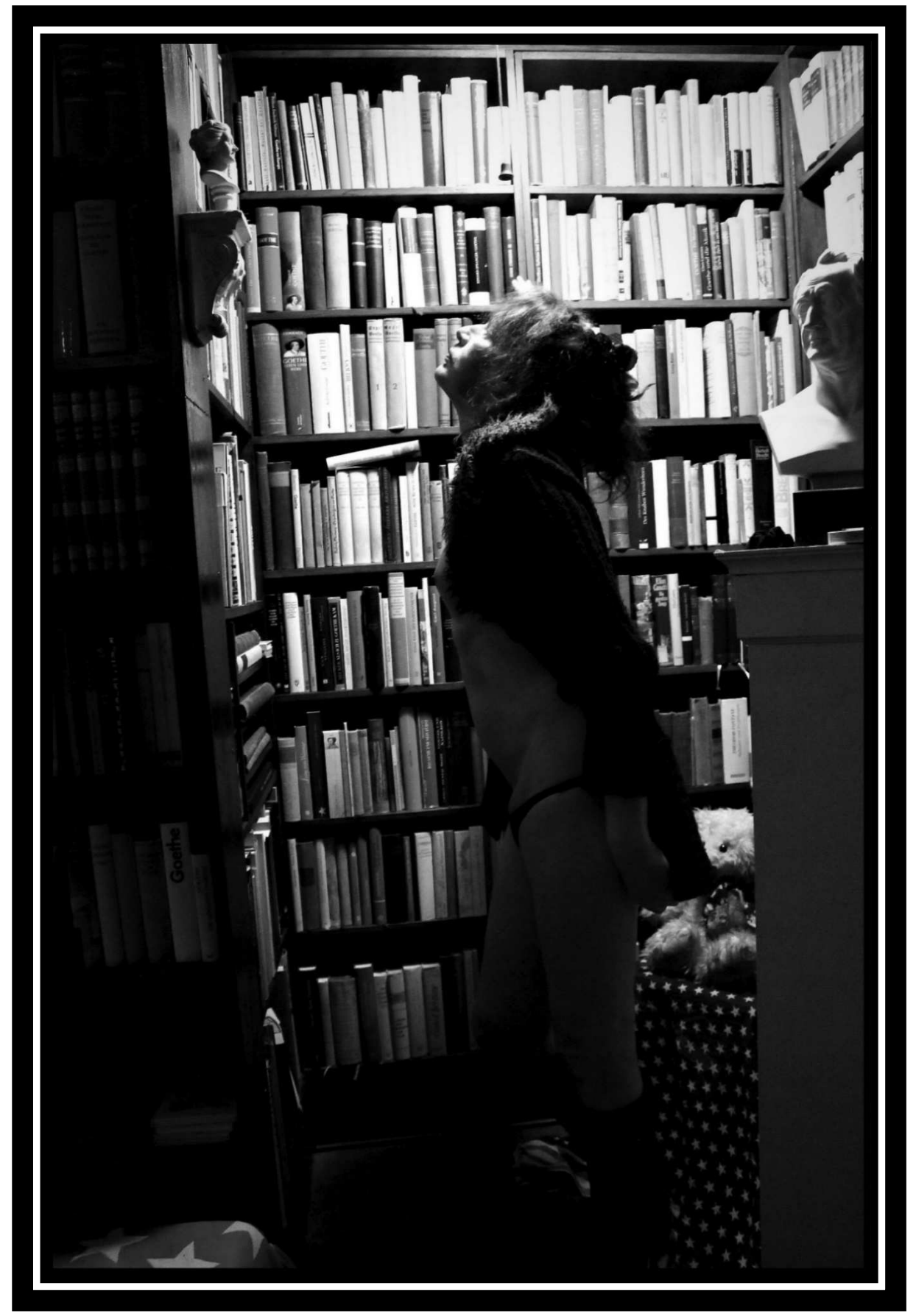
The library (2016).