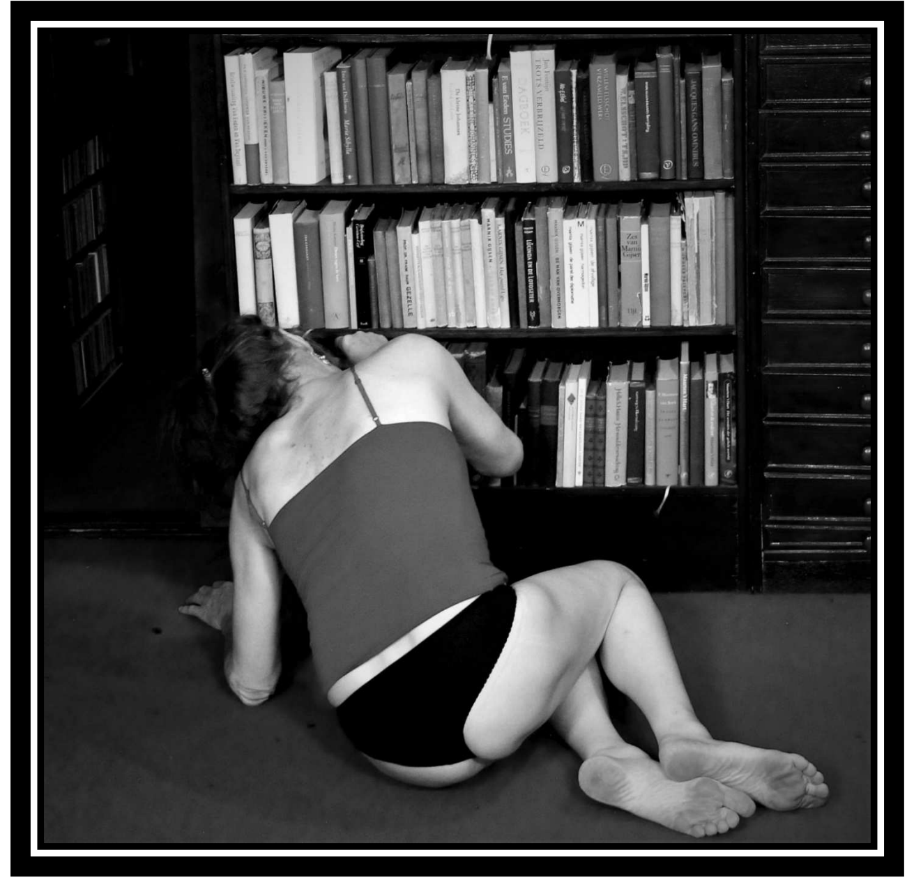
The library (2016).