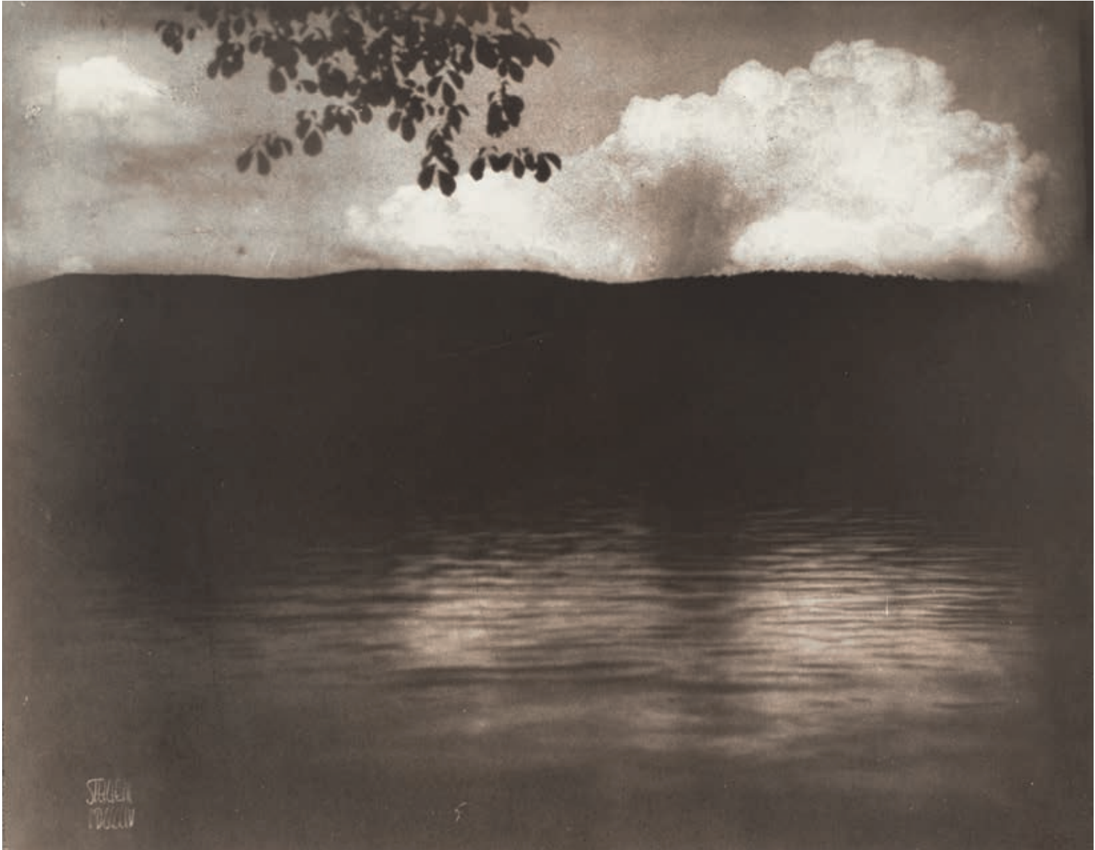
EDWARD STEICHEN BIG WHITE CLOUD , 1904 printed after 1953 gelatin silver print, toned