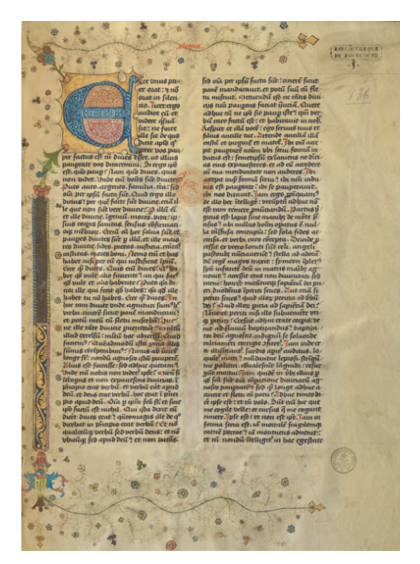
Fig. 13 Ms. 136, f. 1r: Augustine, Enarrationes in Psalmos, Part I (Sint-Maartensdal, Leuven), Brussels, Royal Library of Belgium.

Fifteenth century copies of the Imitatio Christi from Bethlehem have been preserved: Brussels, KBR, ms. 4592–95 (just under 14 cm high) (Fig. 14); Nijmegen, University library, ms. 204 (dated 1497; 14 cm high); Paris, Sainte-Geneviève, ms. 3463 (12 cm high); and Straatsburg, University library, ms. 344 (17.5 cm high).<sup>3</sup> This last manuscript was copied in 1431 by loannes Cornelii, a Bethlehem monk. Also from Bethlehem is an example of the statutes of the Congregation of Windesheim (Brussels, KBR, ms. 11224; latter half of the fifteenth century).