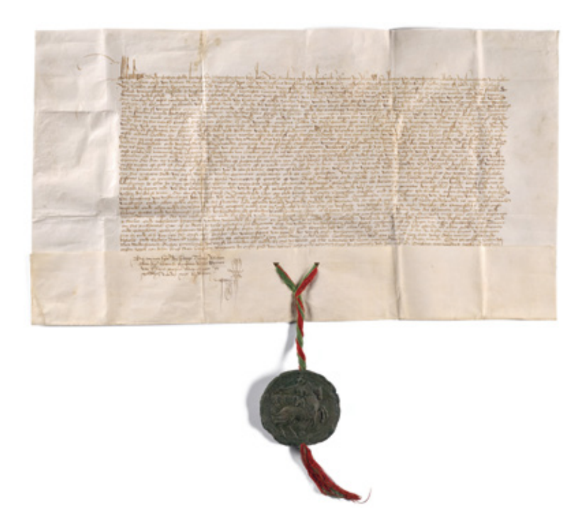
Fig. 2 Charter on parchment with equestrian seal hanging from a braided tail of red and green silk, 1466, Leuven, University Archives, Old University, No. 16.

Pope Martin V founded a Studium Generale in the city of Leuven or Louvain ( in oppido Lovaniensi ) on condition that the Duke, the city magistrate, and the St. Peter's Chapter ceded their jurisdictions to the new institution. The Pope was involved because of his universal authority: University degrees were valid everywhere. On the bottom fold of the parchment of the Charter is the papal lead seal or bulla . It is fortunate that this foundation document certificate was photographed before it went up in flames in August 1914.