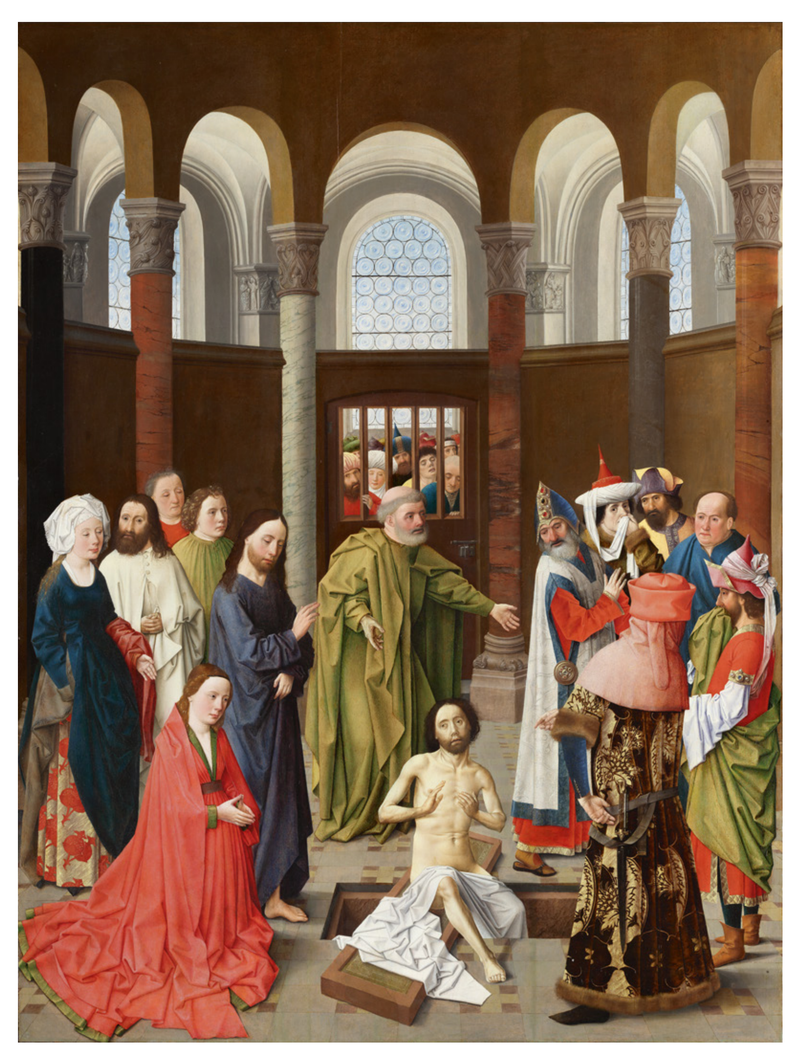
Fig. 19 Albert van Ouwater, Raising of Lazarus, 1465–70, Berlin, Staatliche Museen zu Berlin, Gemäldegalerie, Kat. Nr. 532A.