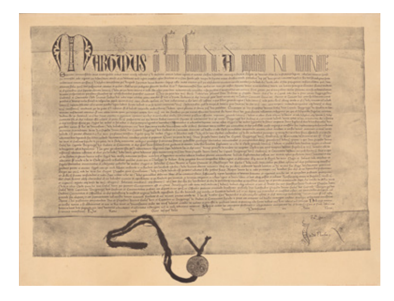
Fig. 1 Papal Bull of Pope Martin V, Rome, 9 December 1425, Leuven, University Archives.

From the fifteenth century, the public and legal status of the university was the focus of much controversy." It was indisputably both a papal foundation and an ecclesiastical institution. It depended simultaneously on spiritual and temporal power, ab utraque potestate, and was unmistakably an institution sui generis. The city held itself to be the rightful owner of the privileges, permitting the University the usufruct of these. The alma mater would also present itself as a 'body of Brabant' (corpus brabanticum), although the Rector did not