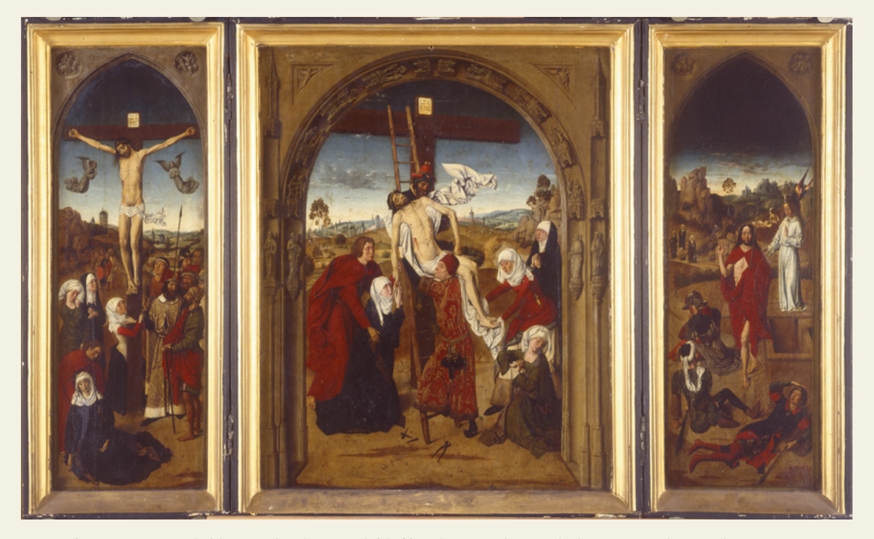
Fig. 39 After Dieric Bouts, Triptych of the Descent from the Cross , end of the fifteenth century, Valencia, Real Colegio y Seminario de Corpus Christi – Museo del Patriarca, Inv. No. Po16.