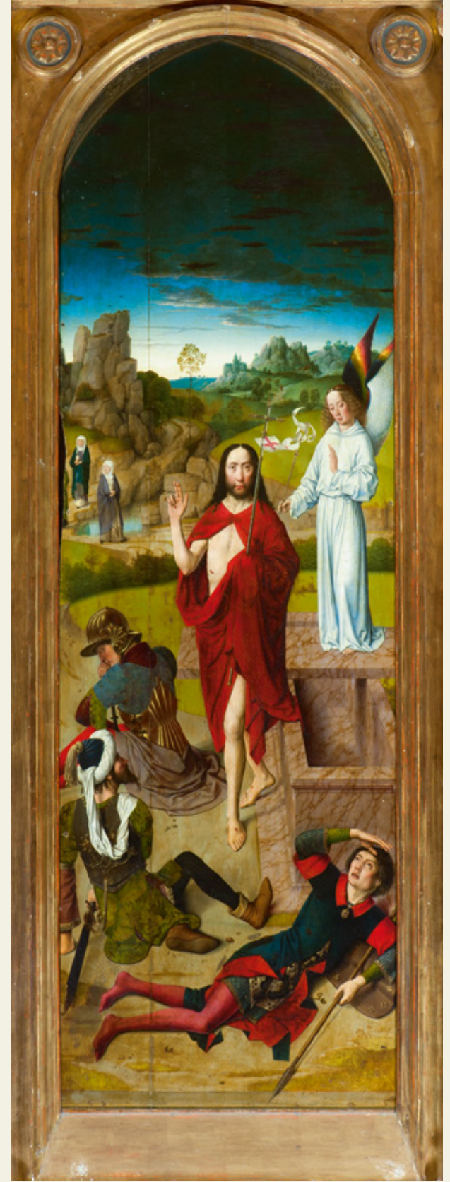
Fig. 38 Dieric Bouts, Triptych of the Descent from the Cross , ca. 1450–58, Granada, Cabildo de la Capilla Real de Granada.