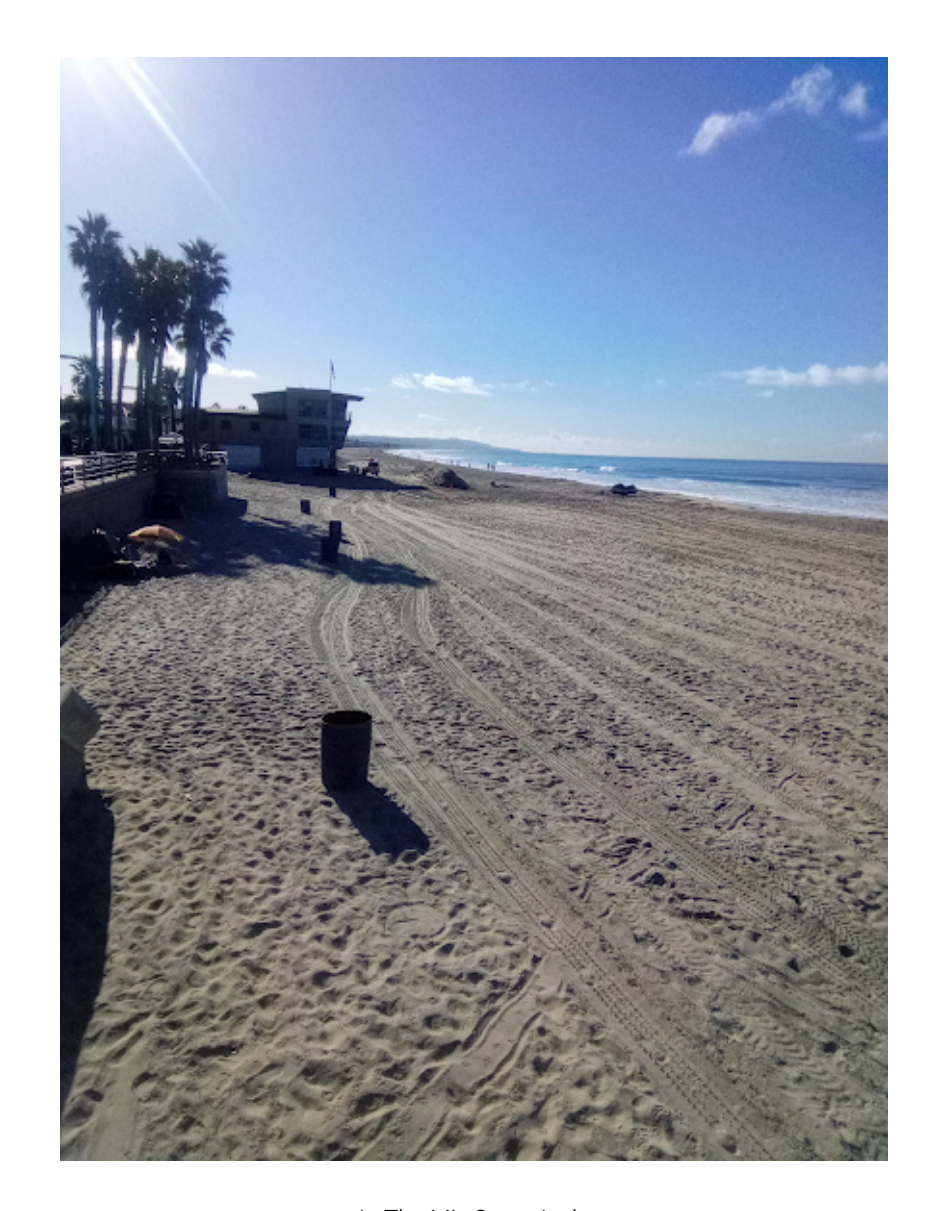
In The Mix Soup Jack.