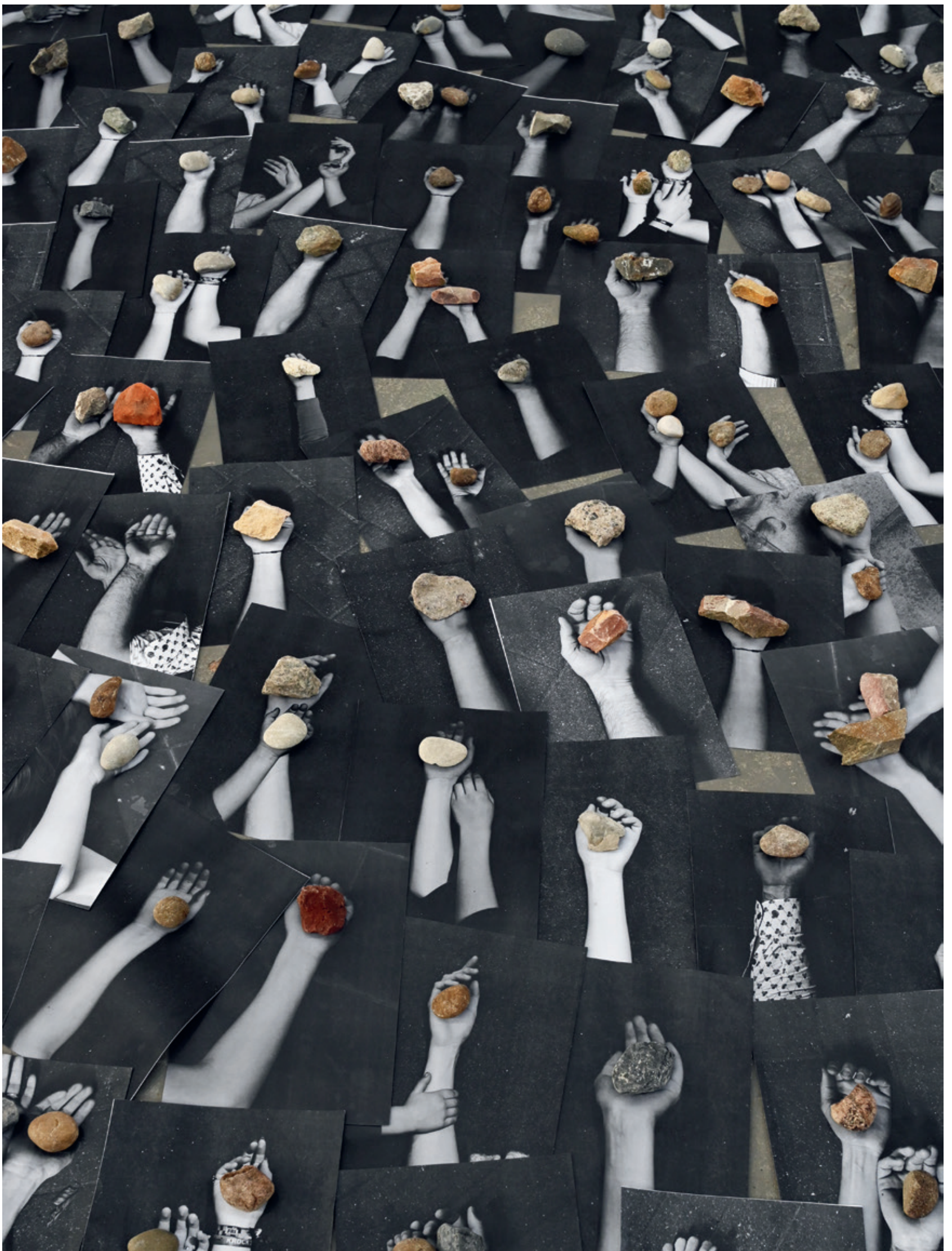
it with both hands. Aim high and hold on, aim high and hold on. Won't come out to play, not tomorrow, not any day. Won't see eye to eye. Nervously waiting, hesitating, her hands are sweaty, frozen